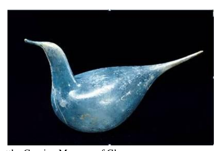
Fig. 3; Glass bird-bottle; Corning Museum of Glass

We can set this passage side by side with two other 'texts', firstly a first century B.C. vessel (6x11.7 cms) made of transparent light blue blown-glass in the shape of a bird from the Corning Museum of Glass.<sup>27</sup>