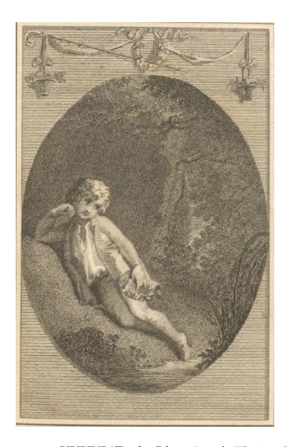
6. Illustration to sonnet XXXVI 'To the River Arun', Elegiac Sonnets (1789)

Contrary to the distant, classicised 'Aruna' of 'To the South Downs', from which Smith seeks Lethean qualities, the Arun here is modest and unadorned. Established in contrast to classical Greece – with its 'fanes' and 'marble domes' – the Arun's site is still 'dear' to the Muse, a place of poetic inspiration to match the classical landscape and imbued with religious power as the 'votary' Otway 'consecrates the stream'.