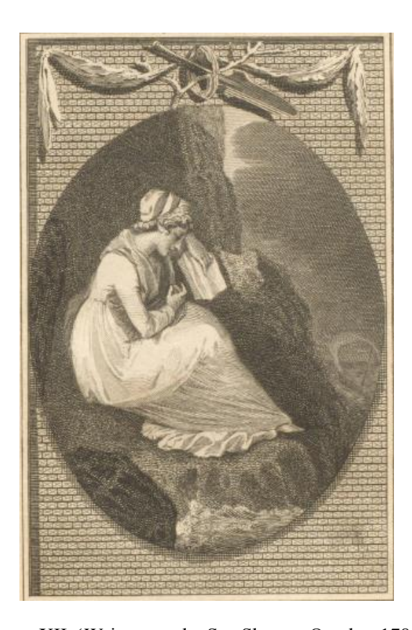
7. Illustration to sonnet XII, 'Written on the Sea Shore – October 1784', Elegiac Sonnets (1789)

As Smith bids 'farewel' to the Arun in sonnet XLV, the sea replaces it in importance in Elegiac Sonnets , and it is in her sea sonnets that her distinctive voice and innovative use of the sonnet form really emerges. It is in the fifth edition of Elegiac Sonnets (1789) that the prevalence of the sea becomes clear, and its presence then increases with each subsequent edition. As her sonnets replace the river with the sea, Smith increasingly disestablishes her sonnets from literary tradition, which the seascape encodes through its lack of a poetic past, and suggests the way Smith has been perceived by contemporary poets such as Wordsworth and Coleridge, as well as the more recent critics who characterise her as a 'Romantic' poet.