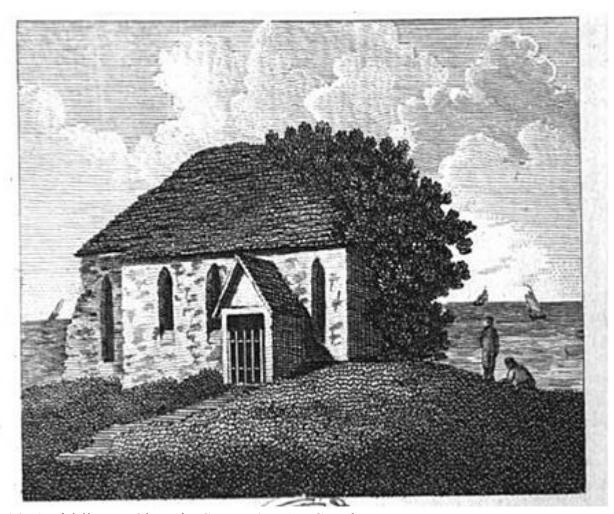
10. 'Middleton Church, Sussex', The Gentleman's Magazine, 98 (1805)