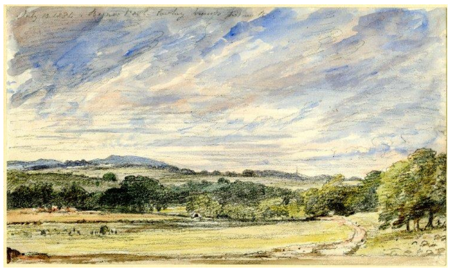
16. Constable, 'July 10 1834. Bignor Park looking towards Petworth'