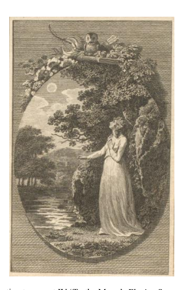
5. Illustration to sonnet IV 'To the Moon', Elegiac Sonnets (1789)

'alone and pensive' in both Highmore's translation and Smith's sonnet.<sup>32</sup> Robinson also shows the presence of Petrarch in sonnet I, and Zuccato his presence in sonnet II, while nightingale sonnet III is of course more directly informed by Petrarch, drawing the 'stream' into the nightingale landscape.<sup>33</sup> The Italian influence on the first edition, through Petrarch and the young Milton, is reflected in its suggestively Italian landscape, which is at the crux of the sonnet's early history, of course, and indeed very origins; although this is undercut through Smith's use of the English form; and indeed, the title-page presents the author as 'of Bignor Park', and sonnet V is place specific. A river also features in one of Milton's Italian sonnets, a means of negotiating the use of Italian, and poetic voice, through place, as Langhorne translates the poem in 1766: 'All for the Sake of lovely Lady fair, | And tune my Lays in Language little tried', thus 'Tamis' forsook for Arno's flowery Side'.<sup>34</sup>