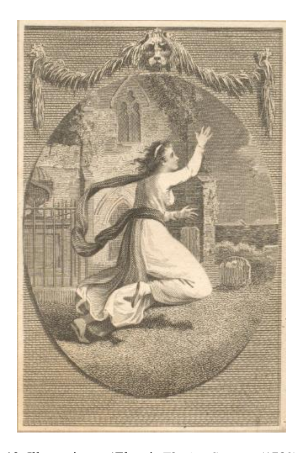
13. Illustration to 'Elegy', Elegiac Sonnets (1789)

The note makes the acknowledgement: "I fruitless mourn to him who [that] cannot hear, | And weep the more because I weep in vain." Gray's exquisite Sonnet; in reading which it is possible not to regret that he wrote only one' (52). There is something elegiac about the observation, acknowledging with 'regret' the isolation of Gray's sad, solitary, 'fruitless' sonnet, with a suggestion of Gray himself in the the one 'who cannot hear', as Smith's dead poetic forbear.