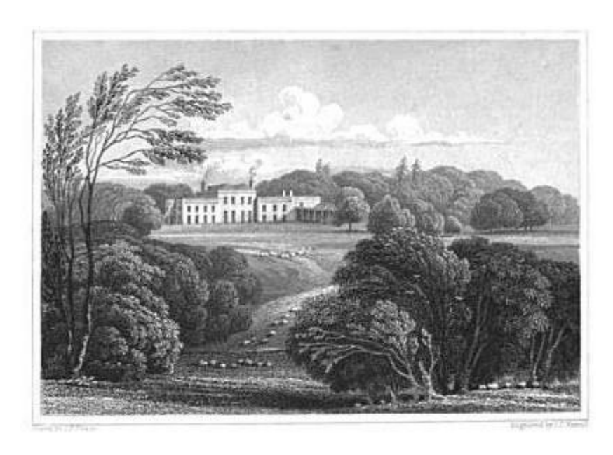
3. Brookwood Hall (Lys Farm) in J. P. Neale, Views of the Seats of Noblemen and Gentlemen, in England, Wales, Scotland, and Ireland. Second Series (London: Smith, Elder, and Co., 1824), vol I

harmony with the scene, than the thrush, the woodlark, and the nightingale, with the tender green and reviving beauty of spring' (XIII, 243-244).