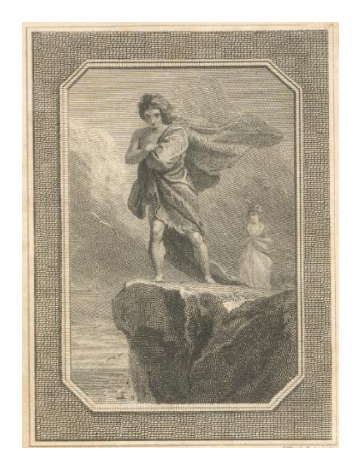
14. Illustration to sonnet LXX, On being cautioned against walking on an Headland overlooking the Sea, because it was frequented by a Lunatic', Elegiac Sonnets , vol. II (1797)