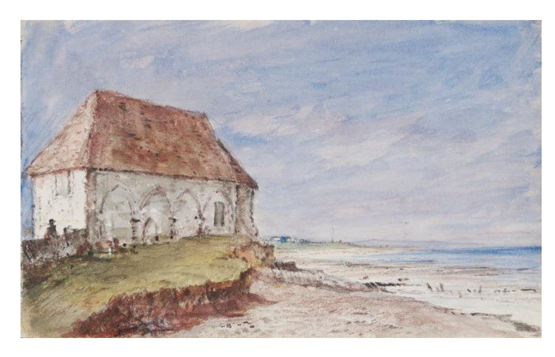
11. John Constable, 'Middleton Church Coast of Sussex-in part washed away by the Sea see Charlotte Smith's Sonnet 10 July', Sketchbook (1835)