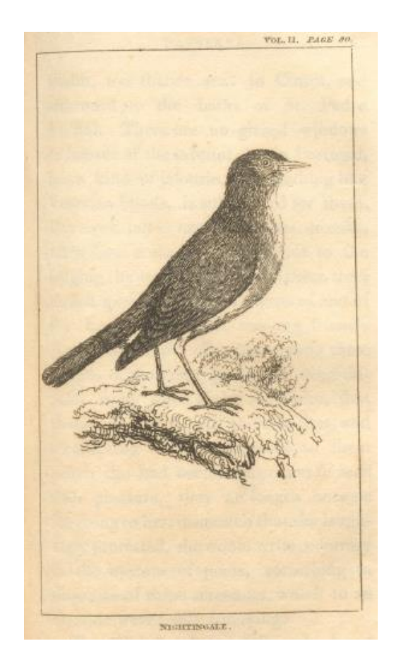
4. Illustration to 'Nightingale' in Charlotte Smith, A Natural History of Birds (London: J. Johnson, 1807)

translation of sorts – for her sister, who is struck by the 'dumb eloquence of the poor injured Philomela' (XIII, 337). At the end of the tale, Philomela's voice, her 'eloquence', is finally restored fully through her transformation into the bird with its expressive and melancholy song.