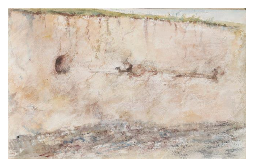
12. Constable, 'Middleton Churchyard and form of a sceleton in the bank of the Churchyard', Sketchbook (1835)

The fifth edition of Elegiac Sonnets significantly shifts the balance to the more experimental in sonnet form. The edition contains twelve additional sonnets, bringing the total to forty-eight and only two of the new sonnets are Shakespearean. Curiously, however, one of the new sonnets is Spenserian, the only one in Smith's oeuvre to take this form: sonnet XLII 'Composed during a walk on the Downs, in November 1787', which is informed by a somewhat different relationship between form, place and content from her sea sonnets. As