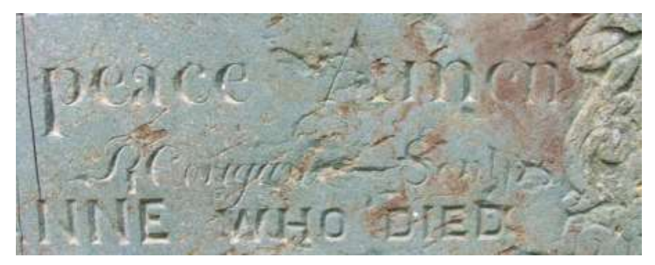
Fig. 5 Signature on the McDonnell stone, 'R Corigan – Sculps'. The inscription below the signature is a much later addition to the stone.