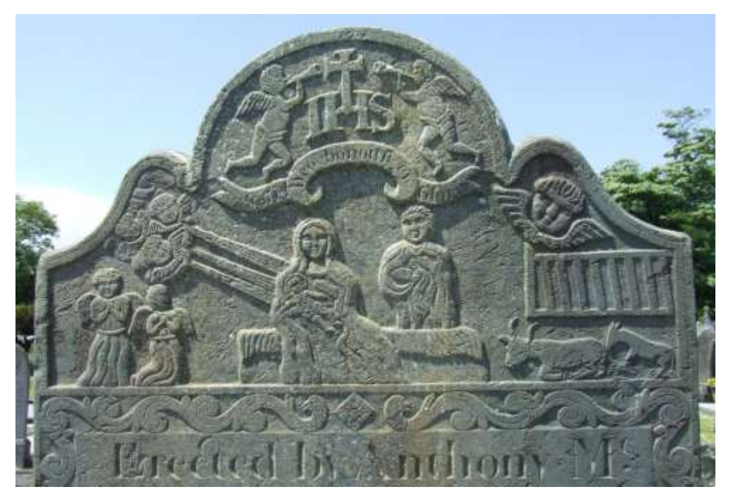
Fig. 6 The Nativity scene on the McDonnell stone, this with a symmetrical inscription on the banner.

Fig. 5 Signature on the McDonnell stone, 'R Corigan – Sculps'. The inscription below the signature is a much later addition to the stone.