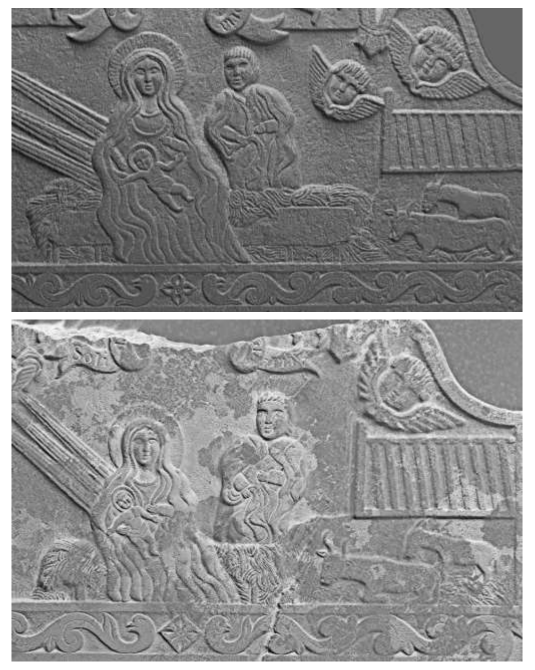
Fig. 7 Spot the difference - Mary and Joseph on the Cath King (died 1819) stone (top) and the James Sheridan (died 1820) damaged stone (bottom).