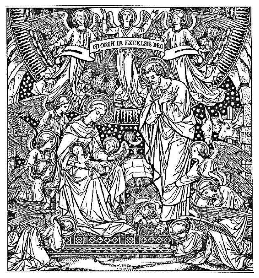
Fig. 8 'In Nativate Domini' illustration with many of the components arranged as on the Nativity stones.