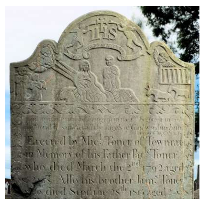
Fig. 2 Nativity scene on the Toner stone, Cord cemetery, Drogheda.