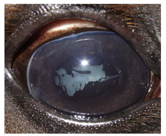
Fig. 3. An 18-year-old Welsh section D gelding showing signs of chronic intraocular inflammation in his right eye. Note the abnormal superior limbal margin, ruptured granula iridica, abnormal pupillary margin with numerous synechiae and dense cataract.

Although the estimated prevalence of glaucoma in the general equine population is considered low, geriatric horses are at increased risk, with a recent study documenting that 65% of glaucoma cases presented in horses older than 15 years.<sup>23–29</sup> There