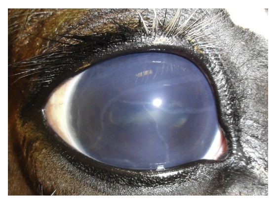
Fig. 4. Glaucomatous eye in a 19-year-old mare. There is diffuse corneal edema and numerous striae (Haab striae) caused by thinning of the Descemet membrane. The intraocular pressure at the time of diagnosis was 47 mm Hg. Note the abnormal pectinate ligament temporally.

Medical therapy for glaucoma involves the administration of drugs that reduce aqueous humor production. \beta -Blockers, such as 0.5% timolol maleate, and carbonic anhydrase inhibitors, such as 2% dorzolamide or 1% brinzolamide, are commonly administered alone or in combination.<sup>24–29</sup> In a large number of cases medical therapy alone is not enough to control the disease; in such cases surgery is indicated. Selective destruction of the ciliary body with laser (cyclophotoablation) transsclerally is intended to reduce aqueous humor production, whereas placement of gonioimplant shunts increase aqueous outflow.<sup>32–37</sup> In addition to specific glaucoma treatment,