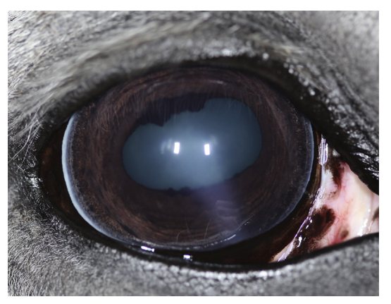
Fig. 2. Central, vertical band of corneal edema in an otherwise normal eye of a 19-year-old warmblood gelding. Serial measurements of the intraocular pressure have always remained within normal limits.

With aging there is also a decrease in the number and density of corneal endothelial cells.<sup>8,16</sup> These cells are essential for maintaining the dehydrated status of the cornea. Animals are born with a fixed number of corneal endothelial cells, and this number decreases gradually with age. Because these cells do not divide, cell loss induced by age or disease cannot be reversed. This cell loss leads to corneal edema and loss of corneal transparency. In addition, this accumulation of fluid can induce the separation of the corneal epithelium from the underlying stroma in the form of small blisters known as bullae<sup>8</sup> that may also affect ulcer healing. Primary corneal endothelial dystrophy has been reported as a cause of age-related corneal edema in horses, frequently presenting clinically as a central vertical band<sup>17</sup> (Fig. 2). This condition should be differentiated from other potential causes of corneal edema, such as glaucoma, uveitis, or traumatic injury.<sup>10</sup>