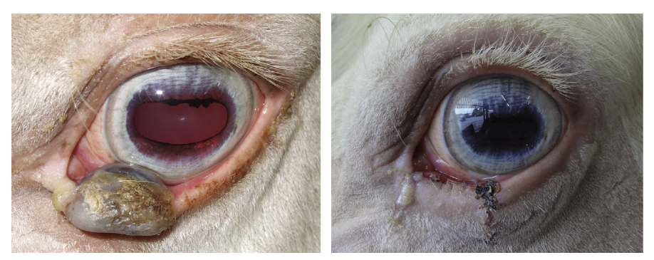
Fig. 9. Melanoma affecting the lower eyelid of a 16-year-old mare before ( left ) and after ( right ) surgical resection.