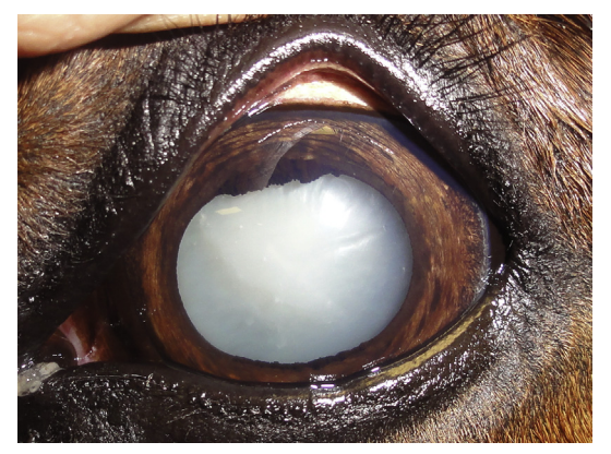
Fig. 5. Complete cataract in the left eye of an 18-year-old Irish draught mare. The lens was removed by phacoemulsification. Fourteen months after surgery the eye remains comfortable and visual. A faint perinuclear cataract was also present in the right eye in this mare.

Although the use of antiinflammatories and antioxidants has been examined, the only treatment of cataracts is surgical removal of the lens.<sup>38</sup> Phacoemulsification is the technique of choice for lens removal in horses, with or without implantation of