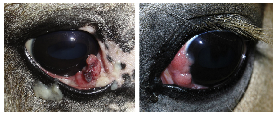
Fig. 8. Squamous cell carcinomas affecting the third eyelid of a 15-year-old Appaloosa gelding ( left ) and the nasal corneolimbal margin of a 17-year-old Haflinger mare ( right ).

Melanoma is a common tumor in mature grey-coated or white-coated horses,<sup>12,53,54</sup> although it can affect horses with any coat color, and frequently affects the eyelids or other periocular structures. In contrast, most cases of intraocular melanoma tend to occur in younger horses between 5 and 10 years of age.<sup>55</sup> Early surgical removal of solitary early-stage melanomas affecting the eyelid is the recommended treatment<sup>53,54</sup> ( Fig. 9 ). Other treatment options, with variable success rates reported, include intratumoral chemotherapy, immunotherapy, and cimetidine administration<sup>53,54,56</sup>