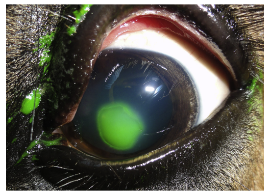
Fig. 1. Superficial, nonhealing, corneal ulcer in a 15-year-old mare. Note the poorly defined ulcer margins and the underrunning of fluorescein beyond the edge of the ulcer, indicating poorly adhered epithelium.

Superficial ulcerative keratitis is one of the most commonly observed ophthalmic problems in horses. In most cases the ulceration heals without complications in 24 to 72 hours<sup>13</sup>; however, on some occasions these ulcers show a prolonged healing time or fail to epithelize. These superficial, nonhealing corneal ulcers are characterized by the presence of chronic (>1 week) ulceration with redundant, loose epithelial borders and no evidence of stromal involvement, infectious agents, or inflammatory cellular infiltrate<sup>7,13–15</sup> (Fig. 1). Superficial nonhealing corneal ulcers can