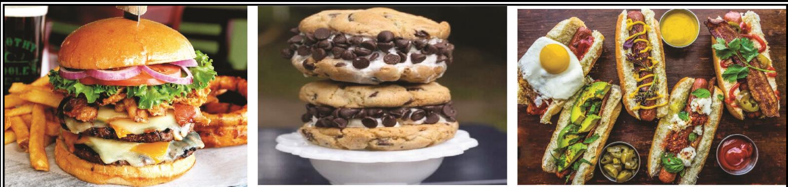
FIGURE 3: TOP THREE FOODPORN RESULTS