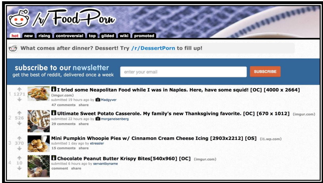
FIGURE 1: TYPICAL REDDIT FOOD PORN PAGE

Screenshot of https://www.reddit.com/r/FoodPorn/ , circa April 2016