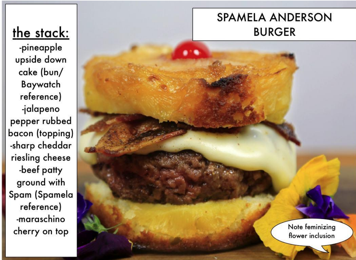
FIGURE 4: THE SPAMELA ANDERSON BURGER