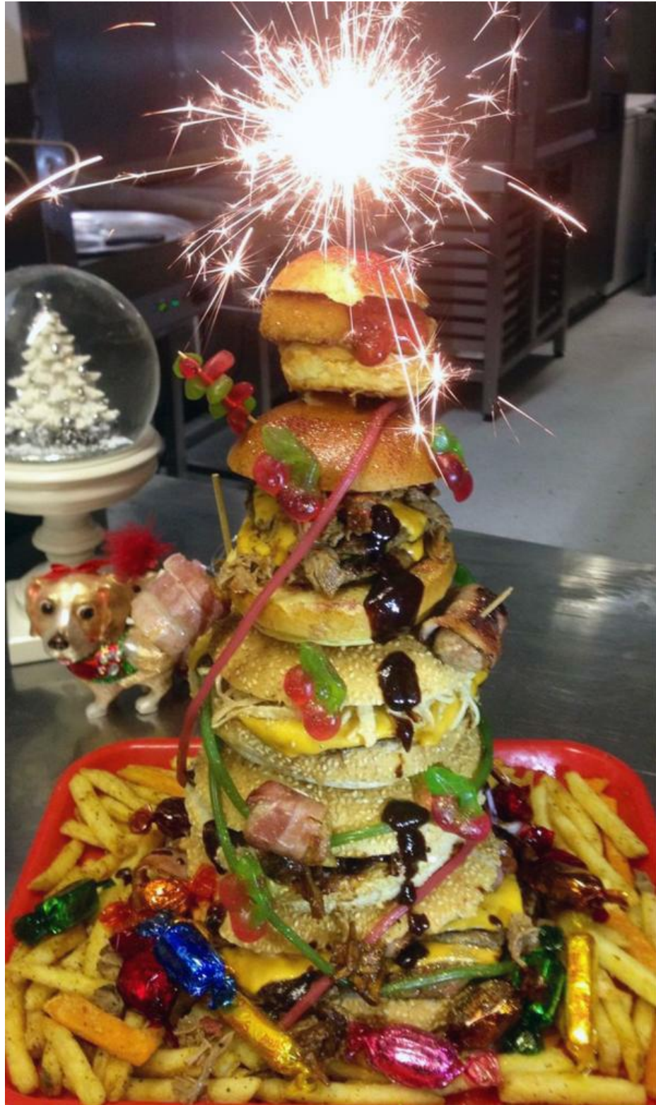
FIGURE 5: ALMOST FAMOUS EXTRAVAGANT XMAS BURGER