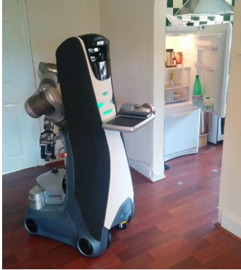
Fig. 3. Care-O-bot in the Robot House