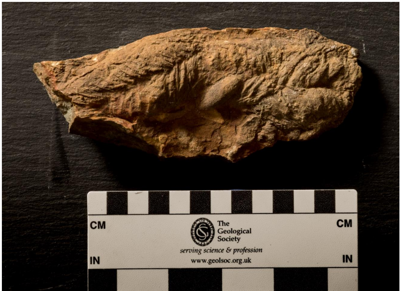
Figure 4: Photograph of a trace fossil 3