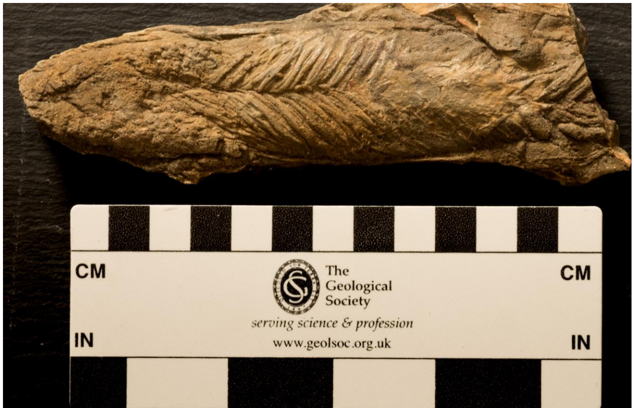
Figure 5: Photograph of a trace fossil 4