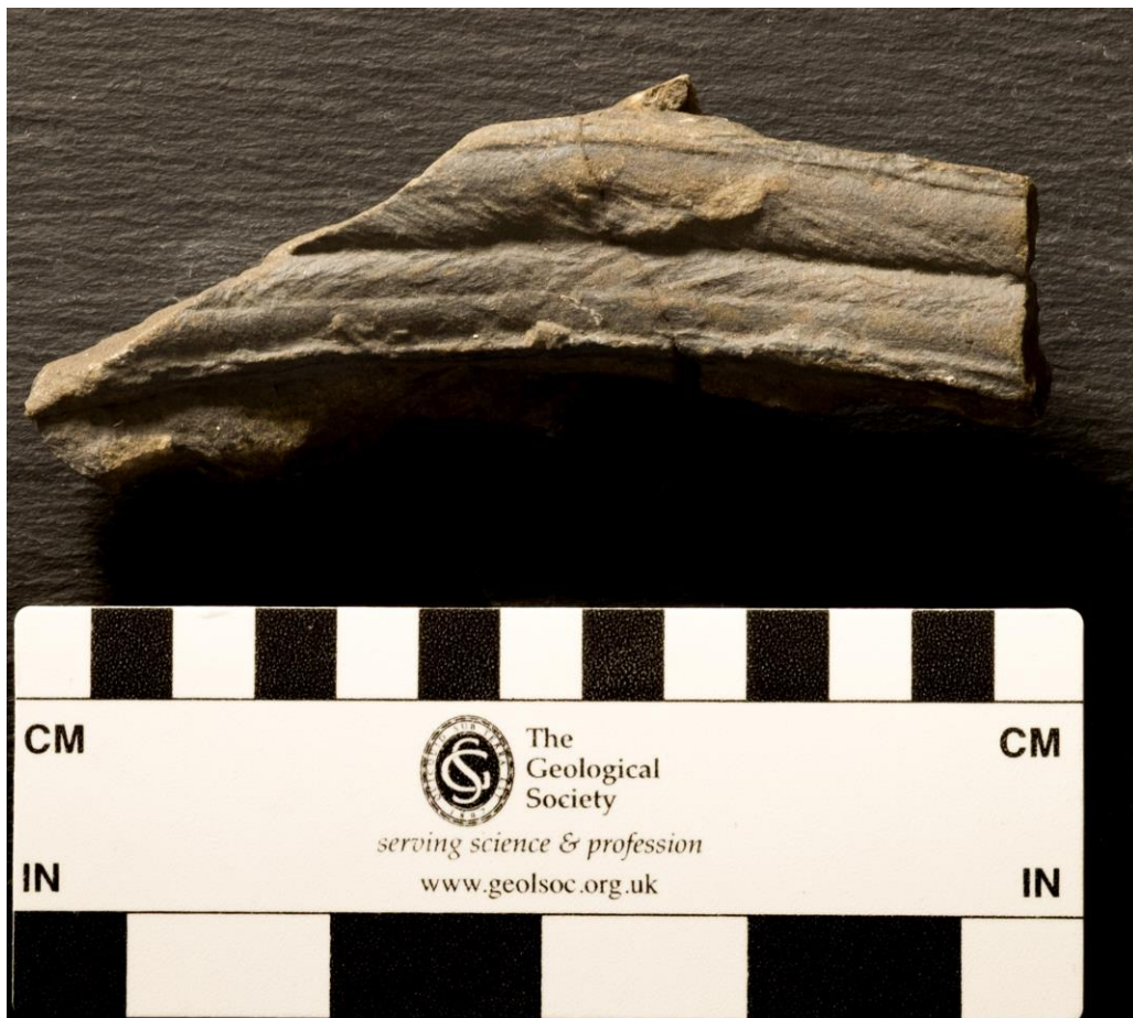
Figure 6: Photograph of a trace fossil 5