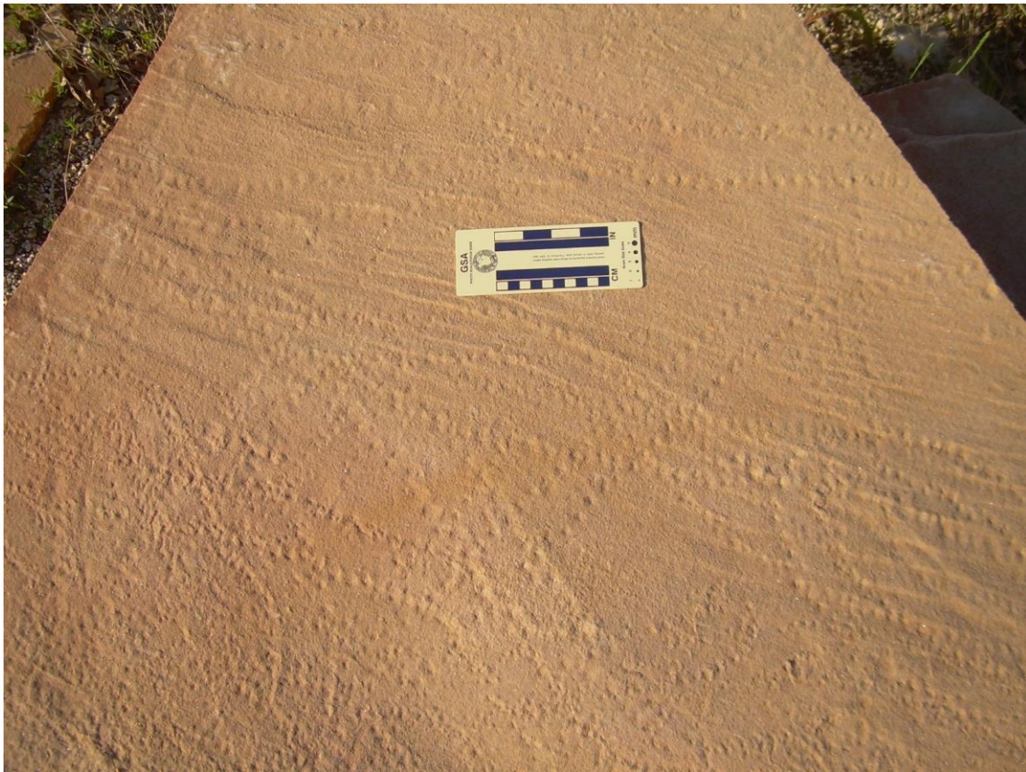
Figure 7: Photograph of a trace fossil 6