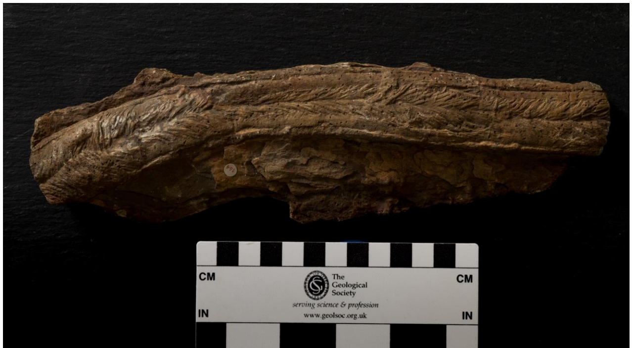
Figure 3: Photograph of a trace fossil 2