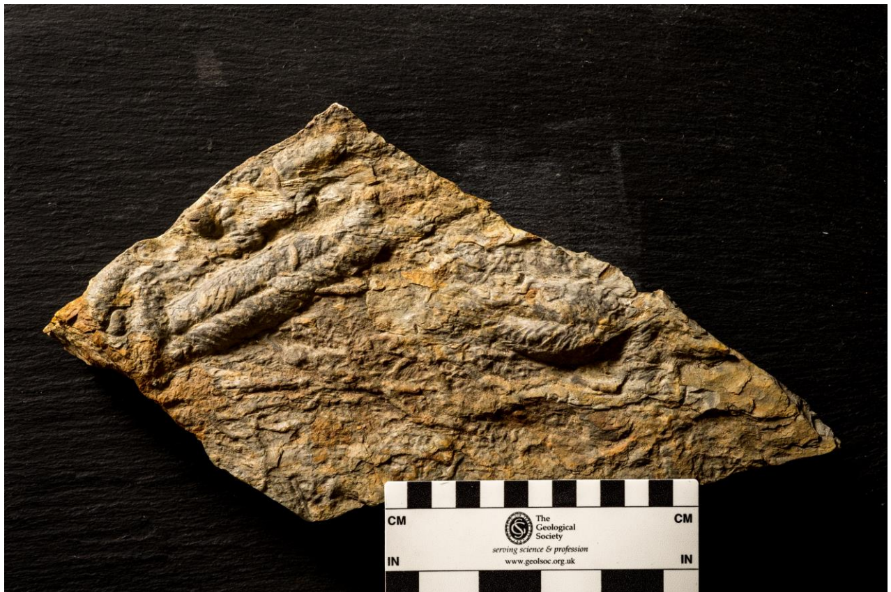
Figure 2: Photograph of a trace fossil 1

Figures 2 - 8 show photographs of different trace fossils associated with trilobites. Trace fossils 2 – 5 are from the collection made by Peter Crimes during the time he worked at the University of Liverpool. For this exercise, try giving your students a copies of these photographs and ask them identify the different trace fossils.