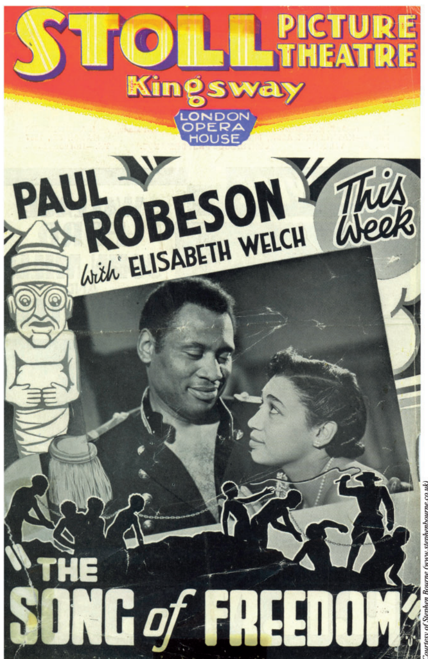
Fig. 3. Film Poster, 'The Song of Freedom' (1936).