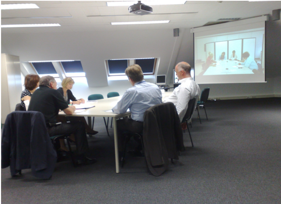
Figure 1: 'Regular' Meeting of a Unit at the European Commission (2009)