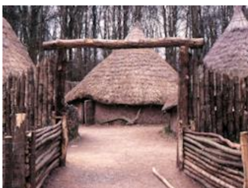
Figure 1: The reconstructed farmstead at St Fagans, now replaced by a different reconstruction

The National Museum of Wales provides training for teachers and downloadable resources from their web pages, as well as opportunities for visits to the galleries to see a wide range of Iron Age artefacts. For many years a reconstructed farmstead was available for the public, and particularly school groups, at St Fagans National History Museum (Figure 1). The individual reconstructed buildings were based on excavated evidence, but drawn from different sites and the enclosure itself was generic; its setting in a relatively damp location on the edge of the site largely devoted to original (though largely moved and restored) buildings from the last few centuries created a slightly discordant context, but once at the site the children could be immersed in the relevant educational opportunities. The National Museum has thus provided important support in understanding the Iron Age, particularly for those schools lying in the most densely populated part of Wales. This reconstructed site has now been removed, but a replacement – based on the excavated site of Bryn Eryr, Anglesey (Longley 1998) – is part of the major HLF-funded Making History project at the museum and is now open. Rather than timber, wattle and daub walls, this reconstruction has 1.8m thick clay walls and has the two roundhouses conjoined (Burrow 2015).