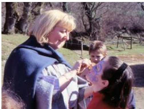
Figure 2: Face painting as part of children's educational activities at Castell Henllys