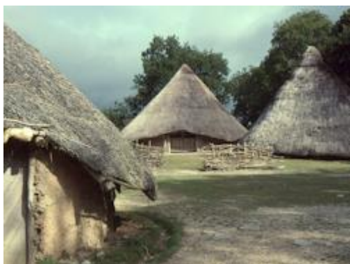
Figure 3: Three of the four reconstructed roundhouses at Castell Henllys, with wattle panels in the centre used for daubing as part of schools activities

There can be challenges in balancing schools provision with that for other members of the public, and this can be seen at Castell Henllys (Mytum 2012 ). The children are enabled to imagine life back in the Iron Age, but the public are in the present and want to understand what it was like in the past, and how we know what we do. These are not issues for the children on the visit (though how we know about the past can be part of what is covered at other times), and this does provide a challenge for both sectors of the audience, and also for the interpreters – in dealing with the public they are in the present, for the children, in the past. These challenges for costumed interpreters are well known across the heritage industry, and there is no easy solution to this. Indeed, being 'in role' has particular dilemmas when so many aspects of the Iron Age are unknown or being challenged by current critiques (see section 6). Indeed, even what roles should be gendered is being investigated, albeit using the regionally and temporally limited British Iron Age burial evidence (Pope and Ralston 2011 ).