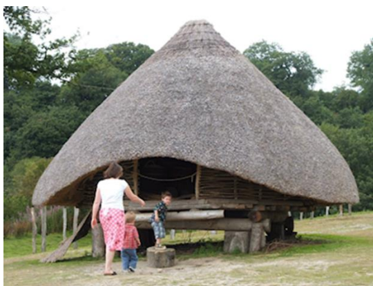
Figure 4: Reconstructed four-post structure at Castell Henllys

There is little doubt that, for all the critiques of those academics who deconstruct on-site reconstructions (Gruffudd et al. 1999; Townend 2007), these create stimulating experiences that are not treated by the public as past reality but as a trigger to stimulate discussion and increase awareness of the sophistication and problem-solving of Iron Age peoples. Indeed the recent dismantling, excavation and ongoing rebuilding of the first roundhouse to be reconstructed revealed much important information about both the resilience of the structure and the archaeological traces created by 35 years of a building's use (Figure 5). The visitors who saw this process of renewal under way were once again engaged with the archaeological process that only is achieved when there is more than earthworks to see.