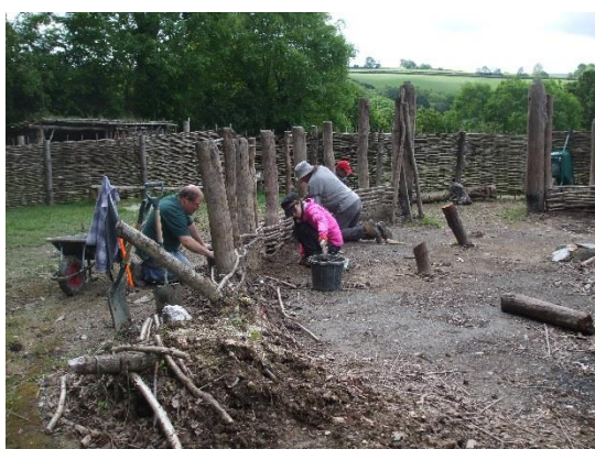
Figure 5: Investigating the first reconstructed roundhouse at Castell Henllys as it was dismantled and excavated prior to its replacement being erected on the same site.

There is little doubt that, for all the critiques of those academics who deconstruct on-site reconstructions (Gruffudd et al. 1999; Townend 2007), these create stimulating experiences that are not treated by the public as past reality but as a trigger to stimulate discussion and increase awareness of the sophistication and problem-solving of Iron Age peoples. Indeed the recent dismantling, excavation and ongoing rebuilding of the first roundhouse to be reconstructed revealed much important information about both the resilience of the structure and the archaeological traces created by 35 years of a building's use (Figure 5). The visitors who saw this process of renewal under way were once again engaged with the archaeological process that only is achieved when there is more than earthworks to see.