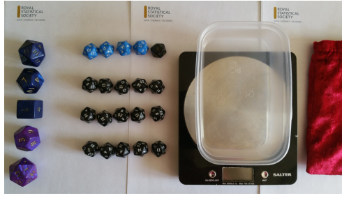
Figure 1: Example of required materials: twenty five objects, a weighing scale, and a draw bag. Note that we have small/large and blue/not-blue objects.