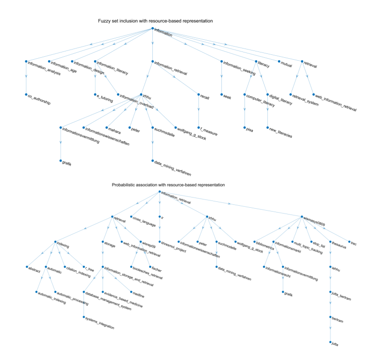
Fig. 2. Hierarchies learned with the two proposed rules. (We suggest to view the figures by zooming in on the digital version of this paper.)

[16]. Two excerpts (due to the limited space) of the learned hierarchies are illustrated in Fig. 2 with fuzzy set inclusion and probabilistic association rule.