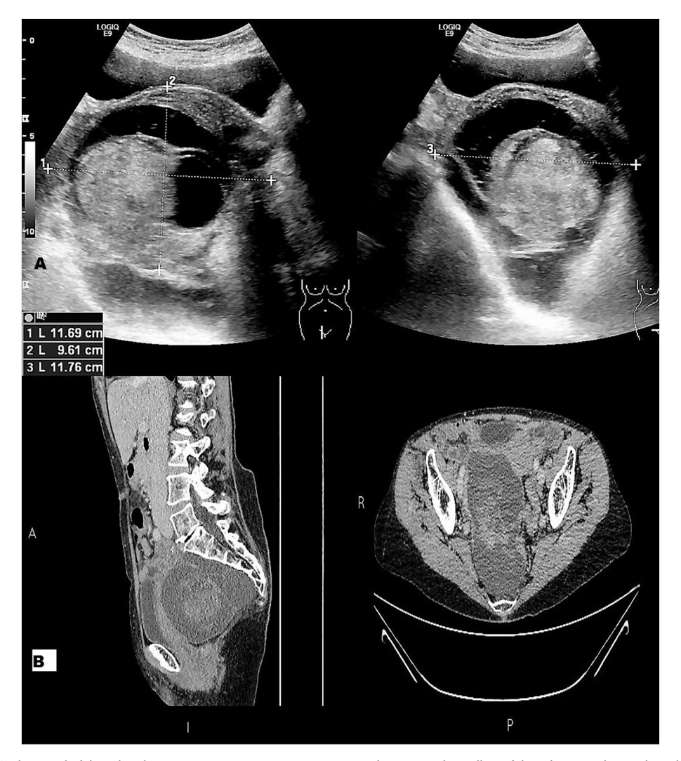
Fig. 1. Imaging findings: (A) Ultrasound of the pelvis demonstrating a 11.7 \times 9.6 \times 11.8 cm complex mass in the midline of the pelvis extending to the right adnexa (B) Abdominal CT scan demonstrating a 14 \times 8.2 \times 9.5 cm heterogeneous multi-septated mass with solid and cystic components originating from the right adnexa.