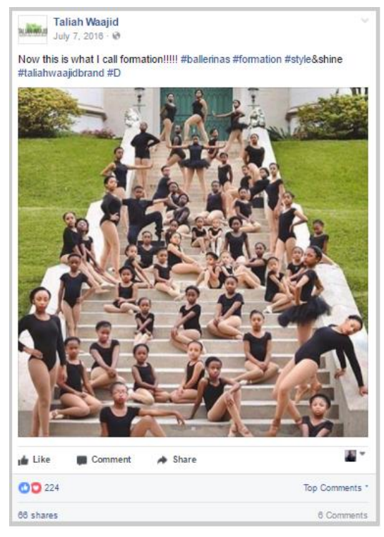
Figure 5. Post and Engagement (c).