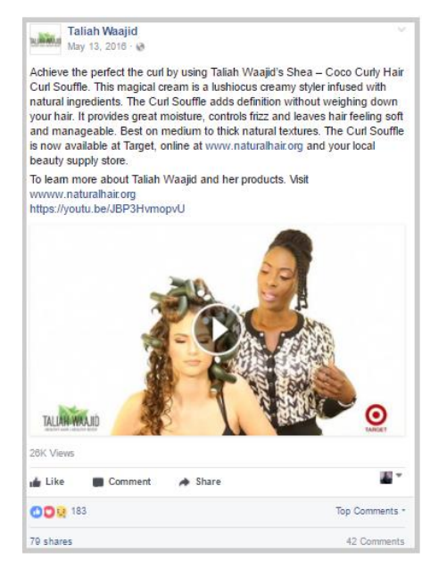
Figure 4. Post and Engagement (b).