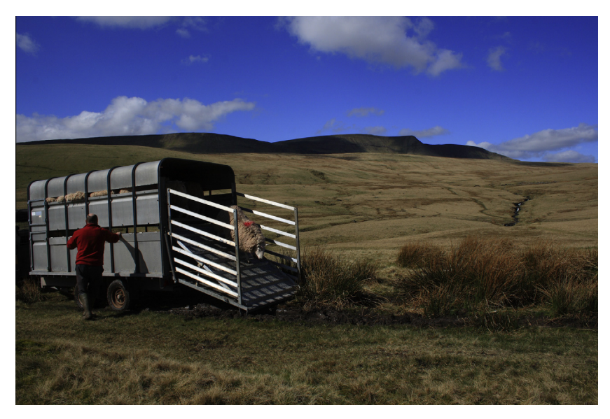
Fig. 3. In marginal grazing systems in Europe sheep often occupy separate summer and winter grazing areas, analogous to the summer and winter ranges of migratory ruminants. In the uplands of Wales, UK, (shown here) sheep are often grazed on extensive areas of land at low stocking densities over the summer period, and sent to lowland dairy farms for winter grazing at higher stocking densities. (Photo: Rose, H.).

Roberts and Grenfell's (1991, 1992) models demonstrate the importance of host removal, which could also include parasite-induced mortality in wildlife hosts, and annual reproduction cycles on the observed patterns of GIN transmission. However, these models consider a population of hosts in a fixed location, such as on a single pasture. Transhumance and movement of livestock between pastures is employed worldwide to maximise the use of seasonally and inter-annually variable resources, primarily water and forage (Boone et al., 2008). Throughout Europe it is common for sheep in marginal grazing systems to have distinct summer and winter grazing areas. In British upland areas, sheep are grazed on extensive areas of common land at low stocking densities between approximately April and November (Fig. 3). The majority of sheep are then "away grazed" during the winter months on improved grassland in lowland areas. On their return from away grazing in March/April, yearlings are turned back out onto the common land and pregnant ewes are maintained at higher stocking densities on limited land or housed near the farmhouse for lambing before