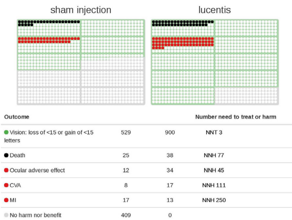
Figure 1 MARINA 24-month data; each dot on this icon array represents the experience of each one of a thousand patients. Benefits are coloured green, death is coloured black, harms are coloured red (when the frequency of an event—in this case visual benefit—exceeds 50% of subjects, the colour surrounds the dot rather than fills it). CVA, cerebrovascular accident; MI, myocardial infarction.

fewer than or gaining 15 Early Treatment Diabetic Retinopathy Study letters (figure 1).