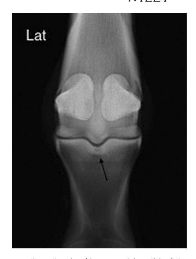
FIGURE 1 Dorsopalmar view of the metacarpophalangeal joint of a horse diagnosed with osseous trauma of the sagittal groove of the proximal phalanx. Medial is to the right. There is an ill-defined radiolucent region surrounded by a more radiopaque area within the subchondral bone of the proximal phalangeal sagittal groove (arrow)

MRI revealed evidence of high water signal in all 21 horses included in the study. In 10 horses, the abnormal signal was localized in the central region of the sagittal groove, approximately halfway between the dorsal and palmar/plantar aspect