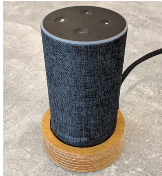
Figure 2. Spkr device