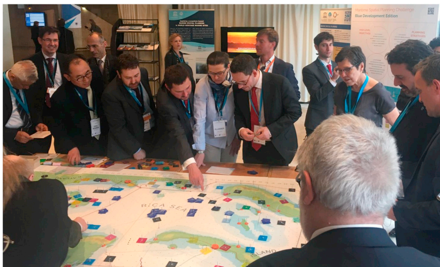
Fig. 1. Impression of the MSP Challenge warm-up board game session in Paris, March 2017.

Challenge's 'learning by doing', or 'learning by playing' approach is both enjoyable and informative for many participants. Although some find the gaming approach to public policy issues such as MSP challenging, there is no doubt that it has stimulated widespread interest and has received overwhelmingly positive reviews. Participants and observers appreciate the gaming format that creates a 'safe place' to develop a better understanding of: