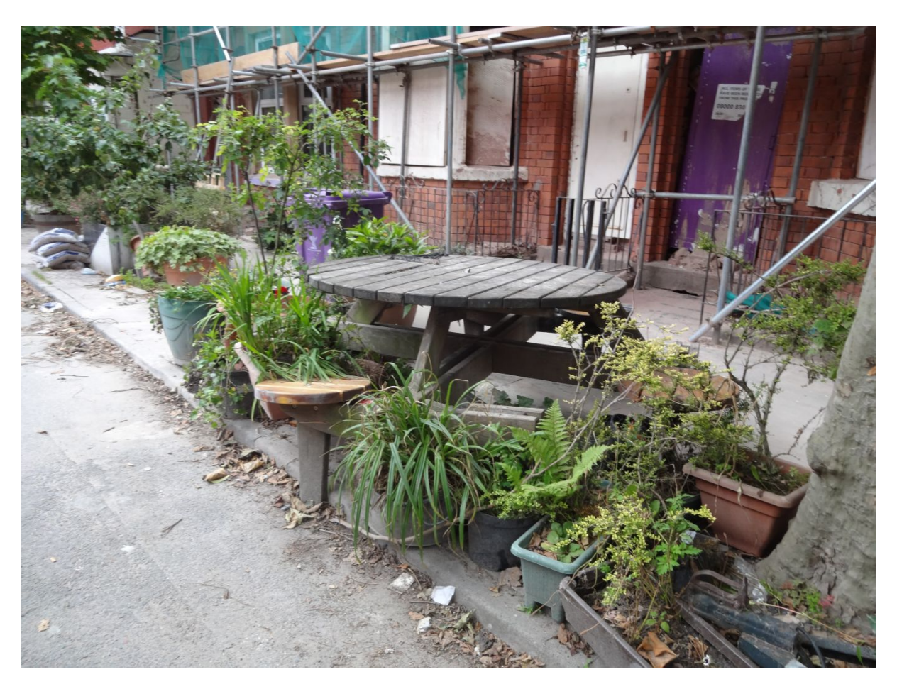
Photo 5: Granby 4 Streets planting project: resistance and regeneration from below