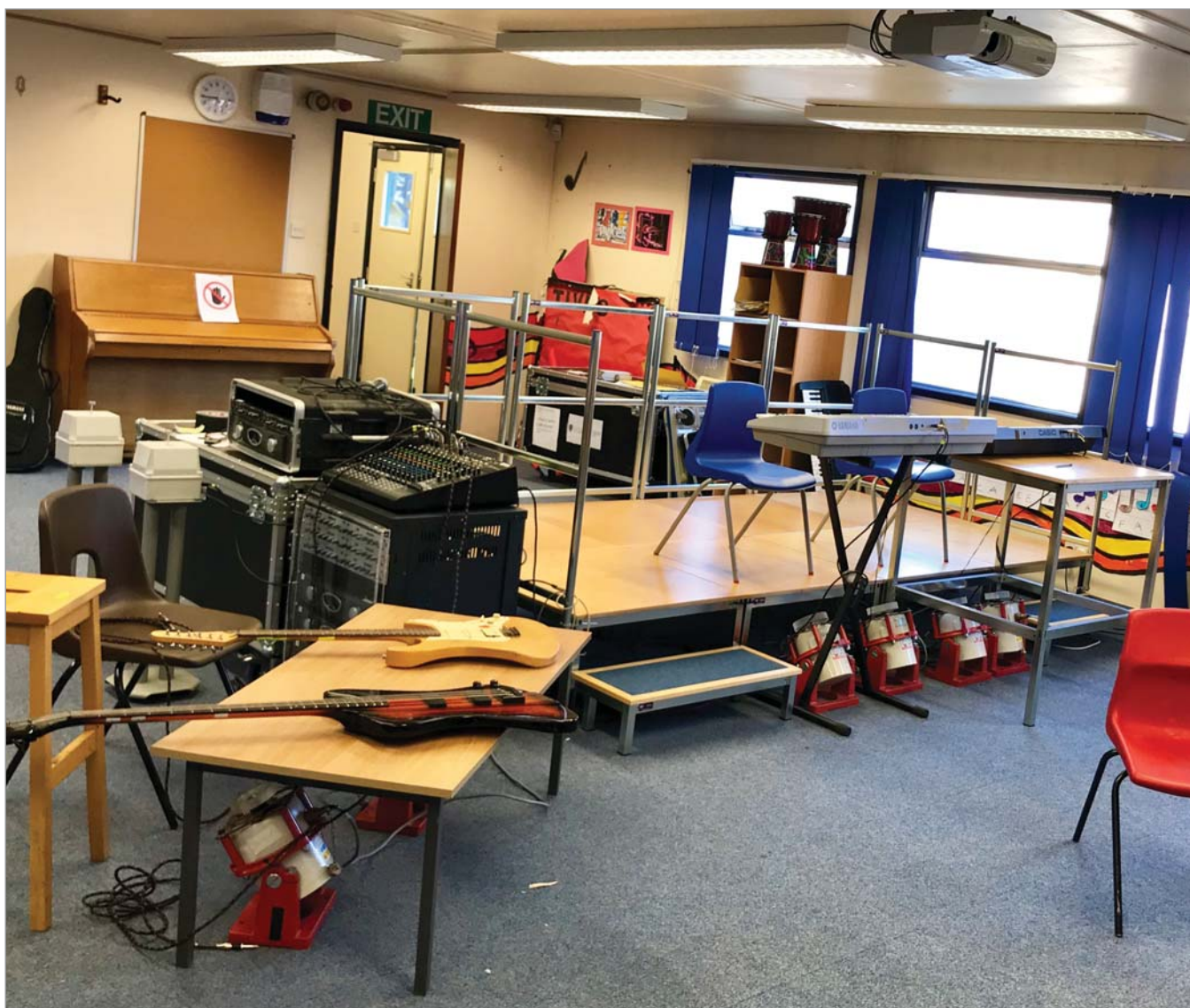
Figure 2. Vibrotactile equipment in the music classroom at the Royal School for the Deaf Derby. Six large shakers for the feet are positioned on the floor, with two smaller finger shakers (encased in grey boxes) next to the mixing desk. (See the shakers in use at https://stream.liv.ac.uk/2qvwd9th )

can cause health problems, for example, white finger experienced by workers using pneumatic drills without protection. Hence, the next step was to identify safe levels of vibration that would allow musicians, whether amateur or professional, to practise or perform for relatively long periods of time whilst avoiding adverse health effects. By identifying the lower and upper limits of vibration it was clear that the available dynamic range and the perceivable range of musical notes made the initial idea feasible. The last step was to use psychophysical experiments to check that it would be possible to make judgements on relative pitch (the ability to recognise that one note is higher or lower than another) for 'simple' musical tones. The results showed that judgements of relative pitch were possible and could be improved with simple, repetitive training sessions, although the smallest interval of a semitone remained challenging even after training.