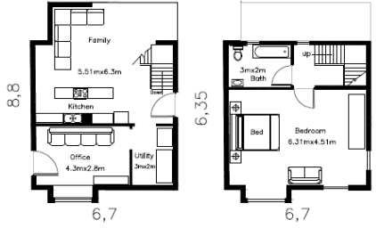
Figure 2. Front elevation and floor plans of the MgOSIP house in UK.

of Wirral , North West England, UK from DIPs panels(MgOSIP) and has been selected as the case study for this paper. Dragonboard Ltd is an SME based in the North West of England [9] and is the supplier of DIPs panels across Scandinavia, France, Ireland, UK, the Middle East and Far East. The SIP house is constructed with DIPS (MgOSIP), concrete, steel, glass, aluminum, insulation, glulam and uPVC. The ground floor consists of an office, utility room and open plan kitchen and family room. The first