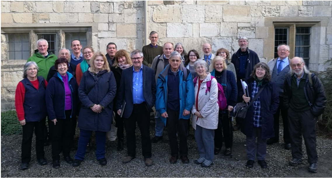
1 - Community participants gather in York at the start of the project