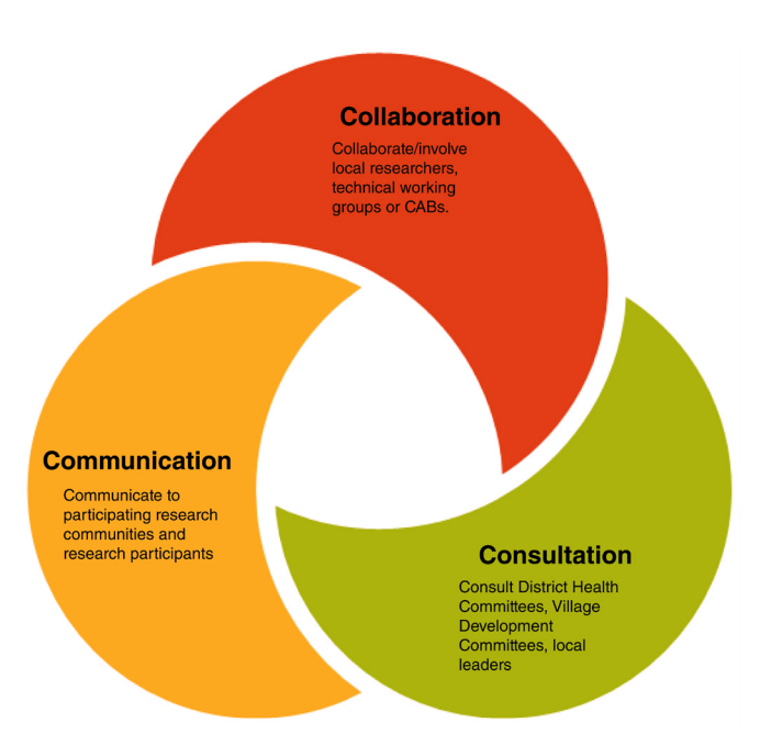
Figure 1. The 3 C's model of participatory community engagement.

Taking into consideration these concerns, workshop participants offered alternative ways in which community engagement activities in a low literacy setting can move up the ladder of participation from simply information sharing to more collaborative partnerships. In the following, we propose an innovative model to provide guidance on how participatory community engagement can be attained throughout the research process. Our proposed model has three steps or 3C's of: 'collaboration', 'consultation' and 'communication'. This model however does not aim to rank the different types of engagement in order of priority. In addition, we also used Dickert's (2015) ethical goals of consulting communities to give examples of how we can move up the ladder of participation to enhance protection, benefits, legitimacy and shared responsibility. By referring to three themes of collaboration, consultation and communication, we use insights from workshop discussions to describe how community engagement can move up the ladder of participation with different community groups (See Figure 1).