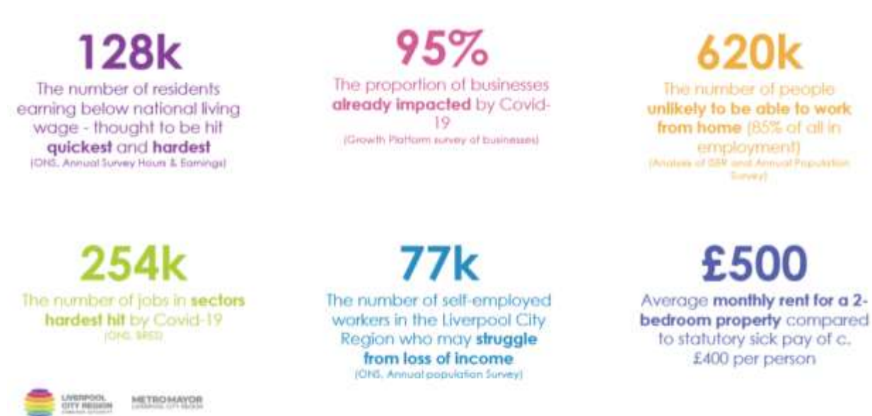
Figure 1. COVID-19 in the Liverpool City Region (LCR) in numbers

crisis; and both will fail to lay the necessary groundwork for lasting recovery and prosperity. A considered, strategic, and impactful response is required.