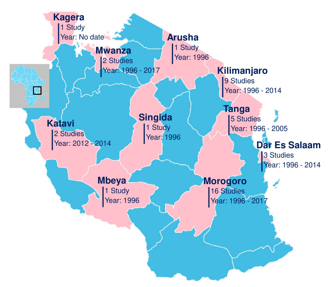
Fig 2. Geographical distribution of Leptospira studies reported from human, domestic and wild animals: Regions colored pink indicate areas with Leptospira studies from 1990s to date and regions colored blue indicate regions where no study was retrieved from the search engine. This map was prepared using Simplemaps <a href="https://simplemaps.com/resources/svg-tz">https://simplemaps.com/resources/svg-tz</a>.

https://doi.org/10.1371/journal.pntd.0009918.g002