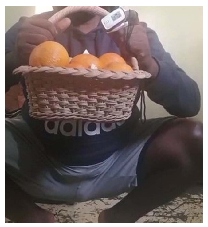
FIGURE 1. Patient performing a goblet squat with weighted overhead reach, improvised with a basket filled with objects including fruits.

Pulmonary Disease Assessment Test [CAT]<sup>12</sup>), and subjective experience of fatigue (using the Checklist Individual Strength fatigue subscale [CIS-Fatigue]<sup>13</sup>). At baseline, the patient scored 3 on the mMRC dyspnea scale and 8 on CAT. According to the Global Initiative for Chronic Obstructive Lung Disease guidelines, <sup>14</sup> an mMRC score of 2 or higher or a CAT score of 10 or higher is indicative that dyspnea was a significant symptom, with a remarkable impact on health status. His CIS-Fatigue score of 43 exceeded the threshold for "severe fatigue" (>35).15