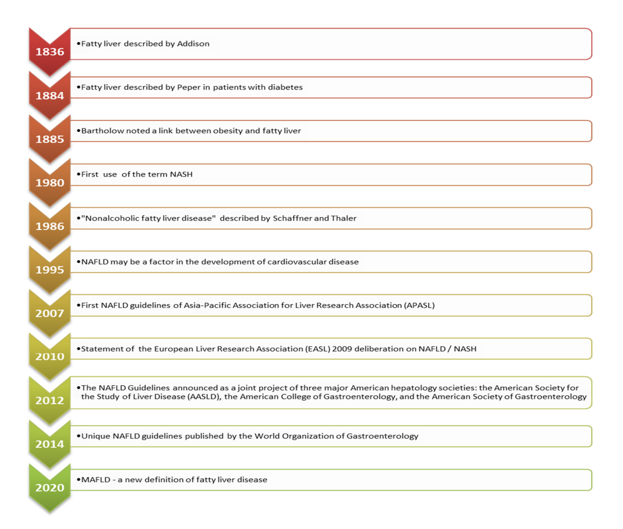
Figure 1. Fatty liver disease timeline [1–8].

The latter definition of MAFLD is based on the presence of hepatic steatosis and at least one other condition such as overweight/obesity, T2DM, or metabolic abnormalities with no additional exclusion criteria [10,11]. Metabolic abnormalities included in the definition cover at least two features from the following: increased waist circumference, arterial hypertension, hypertriglyceridemia, low high-density cholesterol (HDL-C), prediabetes, insulin resistance, and subclinical inflammation [10] (Figure 2). This new definition underlines the importance of cardiometabolic risk factors contributing to liver disease even among patients with other liver diseases and who drink alcohol [10]. Although it should be noticed that although the new definition has been proposed by a panel of international experts from 22 countries, this new nomenclature is not yet accepted by the American Association for the Study of Liver Disease and the European Association for the Study of Liver Disease.