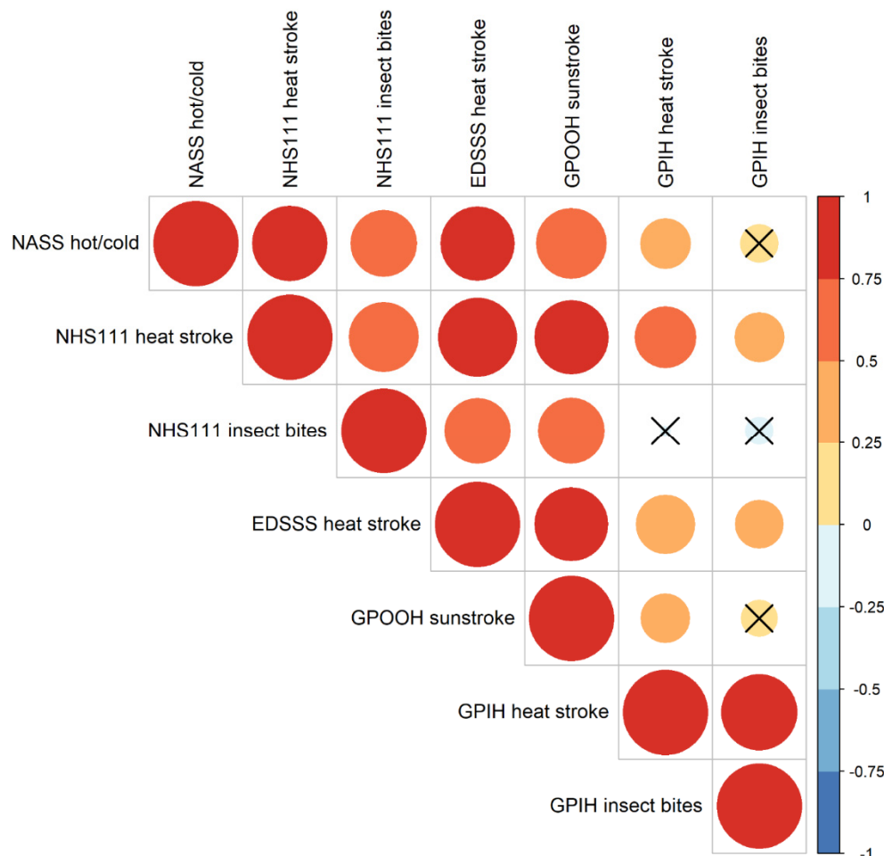
Figure 3. Correlation between NASS heat/cold exposure CPC calls and related syndromic indicators from telehealth (NHS 111), emergency department (EDSSS), GP in hours (GPIH), and GP out of hours’ (GPOOH) systems. Each circle represents a correlation pair (small circles represent a weak and large a strong correlation, respectively), with the color and size dependent on the pairs correlation co-efficient ( r ). Circles without crosses represent significant correlations and circles with crosses signify non-significant correlation between indicators.

( r = 0.61 ), EDSSS heat stroke ( r = 0.76 ), GPOOH sunstroke ( r = 0.68 ), and GPIH heat stroke ( r = 0.34 ). NASS heat and cold calls were not significantly correlated with GPIH insect bites ( r = 0.19 ; Figure 3).