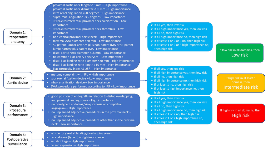
Figure 2 Risk stratification model. *calculated by dividing the distance along the central lumen line from the aortic bifurcation to the common femoral artery by the straight-line distance from the aortic bifurcation to the common femoral artery. A ratio of <1.25 is optimal while a ratio of >1.6 is deemed as severe. AAA, abdominal aortic aneurysm; EVAR, endovascular aneurysm repair; IFU, instructions for use; IMA, inferior mesenteric artery.