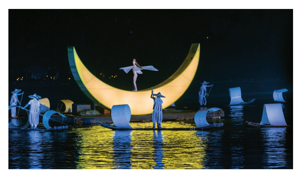
Figure 9. The daughter of Li River dancing on the moon