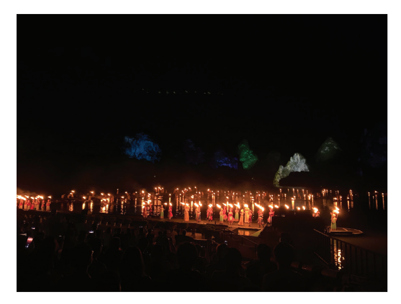
Figure 5. Zhuang ethnic minority people singing mountain songs