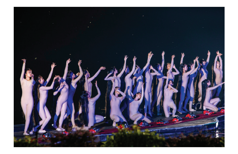
Figure 10. Zhuang girls bathing before marriage

of the film when she became engaged to her lover, A Niu. However, for Impression Liu Sanjie , the music of the ballad was altered and rearranged in a pop music style by Meng Ke, a prominent Han composer. The only element untouched in this song is the romantic lyrics: