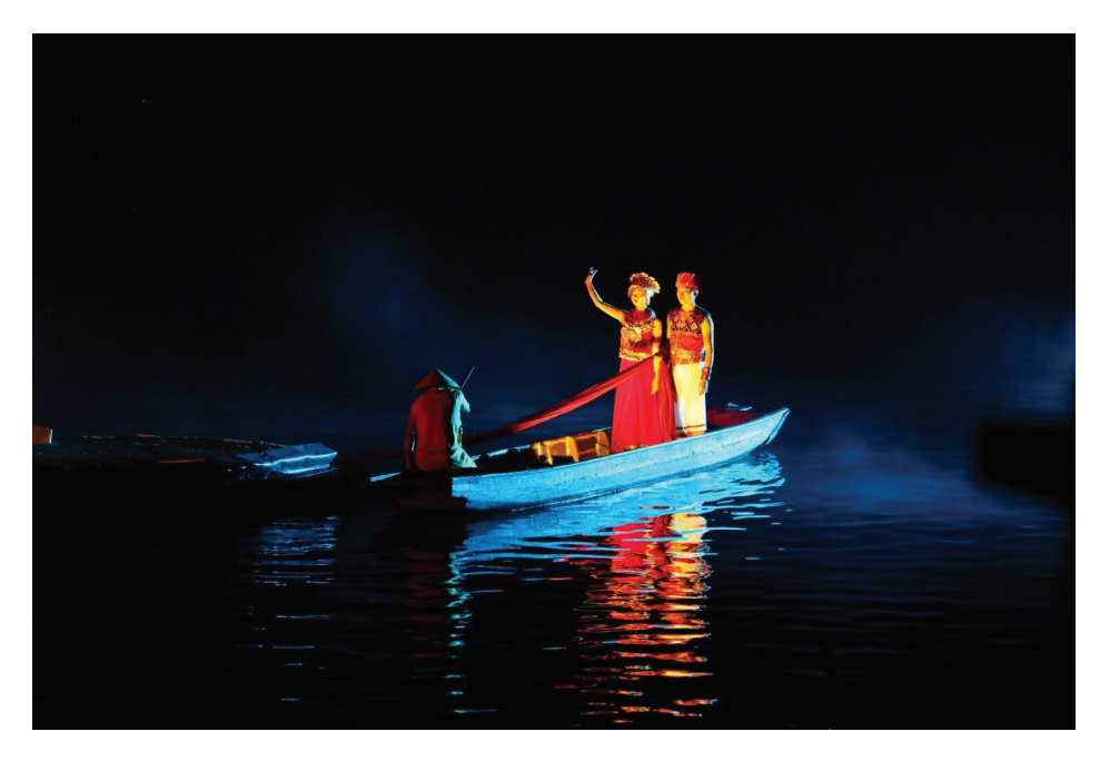
Figure 11. Zhuang wedding ceremony