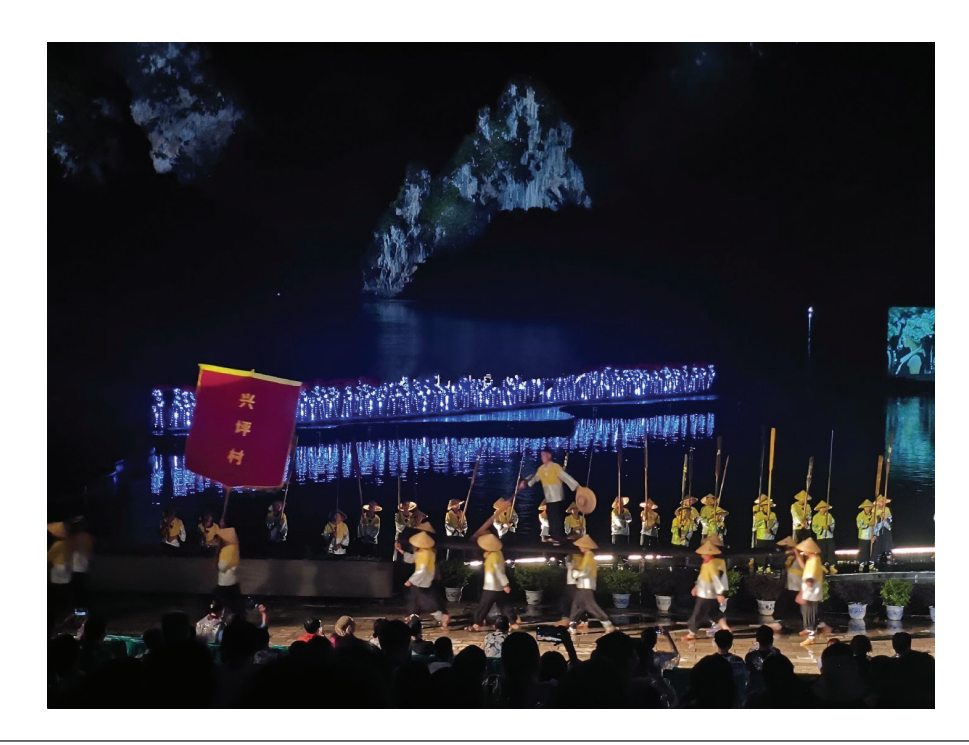
Figure 13. Han peasants representing their own villages