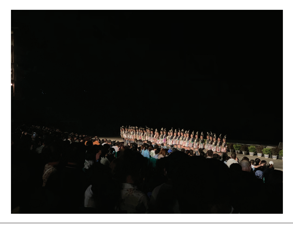
Figure 7. Dong ethnic children singing Dong big songs

Flowers atop the mountain make fragrance in the foothills, Water under the bridge cools the top of the bridge . . . It reaches deep into the mountain and the old forests . . . (Lyrics from Bursting with Mountain Songs )