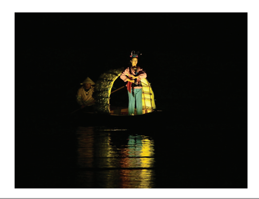
Figure 4. Liu Sanjie in Impression Liu Sanjie