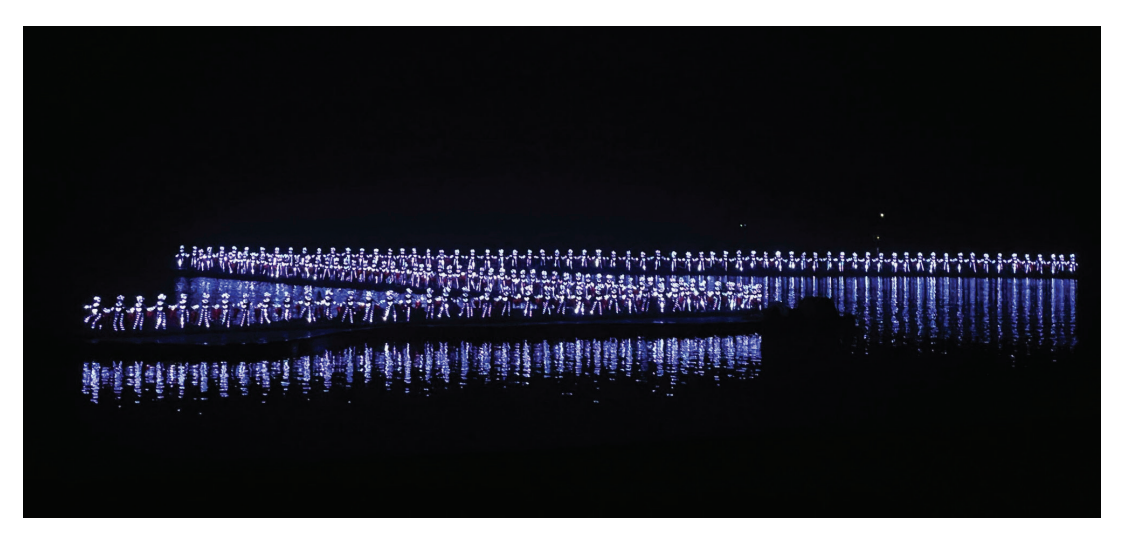
Figure 12. Miao costume walking show