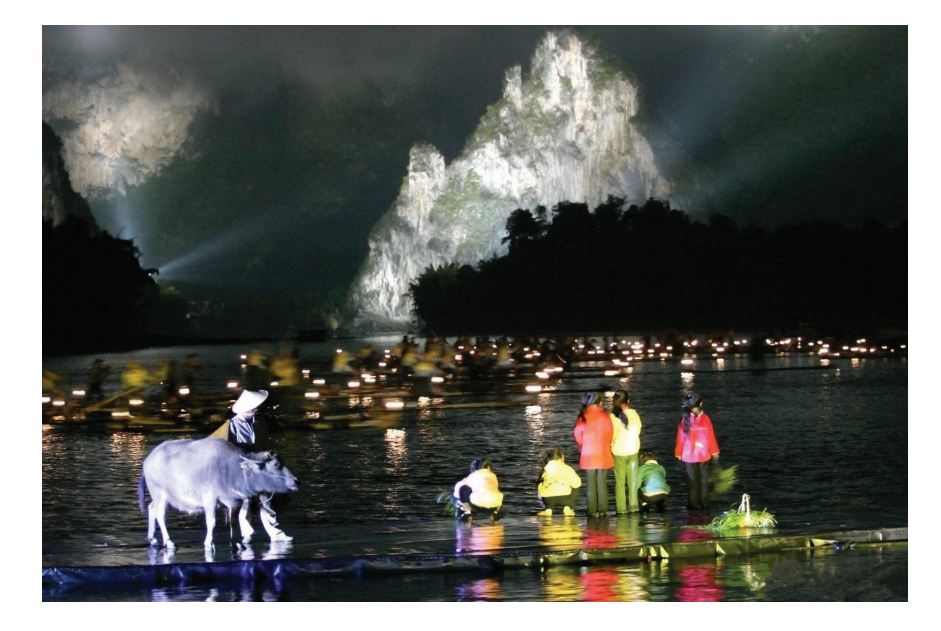
Figure 8. Fishing lights show

This performance of the golden fishing lights is simply an art show of golden lights fixed on fishing boats, providing the colour theme. Over a hundred boats rowed by fishermen and equipped with fishing lights sail along the river and several children play upon the stage, enjoying the fishing lights. A herdsman leads a water buffalo towards them, which creates a dreamlike and harmonious atmosphere (see Figure 8). Though Liu Sanjie is still not a physical presence in this phase, she is abstractly represented as an impression. In this phase, the only part which has something to do with Liu Sanjie is the song from the original recording of the film, but with the class struggle lyrics removed.