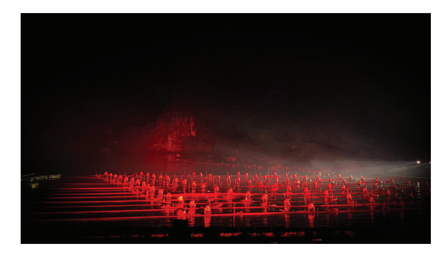
Figure 6. Local Han peasant performers

the film Liu Sanjie .<sup>11</sup> Along with a group of boys, they are all dressed in Zhuang ethnic costumes, singing Zhuang mountain songs (see Figure 5). After the duige performance, the local Han peasants and fishermen give a performance with giant red silk sheets laid out upon the water to represent their fishing nets (see Figure 6). Fishing is an important part of many local people's lives. This part of the show is an abstract manifestation of contemporary art which displays symbolism and conceptual themes. This spectacular red scene, full of Zhang Yimou's artistic imprint,<sup>12</sup> is performed by over 80 peasants. Zhang Xiao, the music composer, devised this modern means of expressing the local culture: