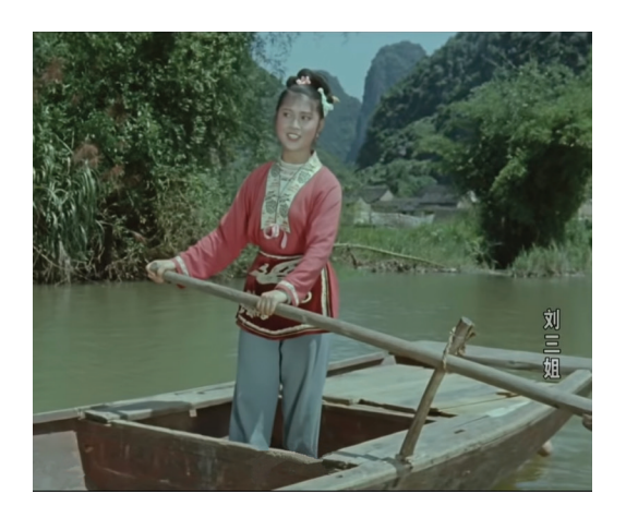
Figure 3. Liu Sanjie in the musical film