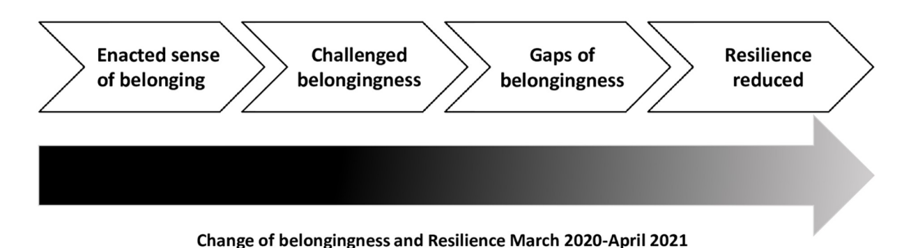
Fig 3. Challenged belongingness and its impact on resilience: First year of COVID-19.

https://doi.org/10.1371/journal.pone.0276561.g003