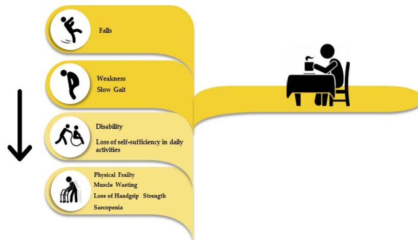
Figure 2. Graph overview of the results.

Details of the design (cohort, cross-sectional), sample size (N) and sex ratio (%), minimum or age range, study population, and the country of each study are provided in Table 1. The cross-sectional (90%, N = 9 out of 10) predominated over the longitudinal design [30]. The recruitment contexts were community-based, except for one that collected data from universities, colleges, and technical schools [27] and one in a hospital context [33]. The geographical setting of the selected studies was evenly distributed between Asia (N = 5/10, 50%) and Europe (N = 4/10, 40%), with an American minority [24].