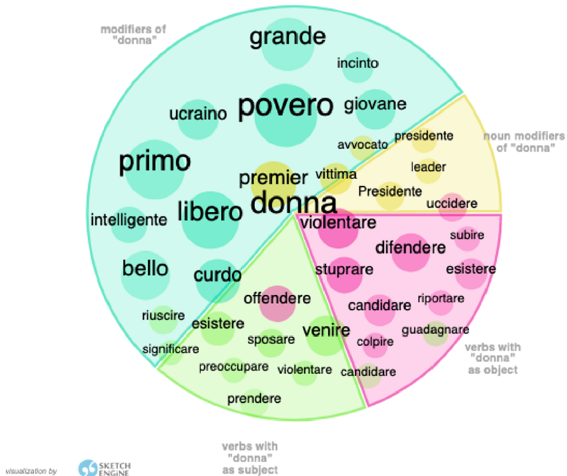
Fig.4 Word sketch for the term “donna” in toxic replies towards women politicians

Although there is high lexical variations in the replies due to variations in topic, we noticed that explicit reference to women through the use noun “donna/e” (woman/women) is frequently attested (1198 occurrences) in toxic replies targeting women, while much rarer in those targeting men (218 occurrences). A closer look to the words co-occurring in the same context divided as to grammatical function (word sketch through Sketch Engine) reveals that not only “being a woman” is topicalized, but it is talked about next to abusive terms: