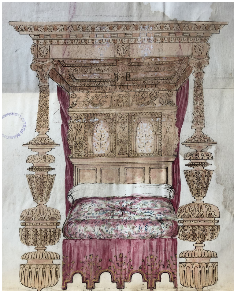
FIG. 7. George Shaw, an Elizabethan bed. M175/2/3, 139

to create new pieces of marketable furniture, most of his output is entirely modern but derived directly from late medieval woodwork that he had surveyed and, on occasion, collected and reused. 43 Describing the pulpit at St Chad's in Rochdale, for example, Shaw wrote that it is 'a very handsome one, made of oak and covered with carving[.] It is very old, and nearly as black as ebony [... ] Every thing about it is so very perfect'. 44 Similar records concerning furniture can be found throughout Shaw's descriptions of historic buildings in Lancashire, such as Glodwick Hermitage in Oldham; the hall contained 'beautiful ancient carved oak work from the old Hall of Dene Street belonging to the family of the Swires, [and ... ] an old black oak chair, from the same place, in the corner of the room'. 45 He also drew records of such interiors and furniture, including Tabley Hall in Cheshire, the 'Prior's chair from Southwick Priory, Hampshire', and an