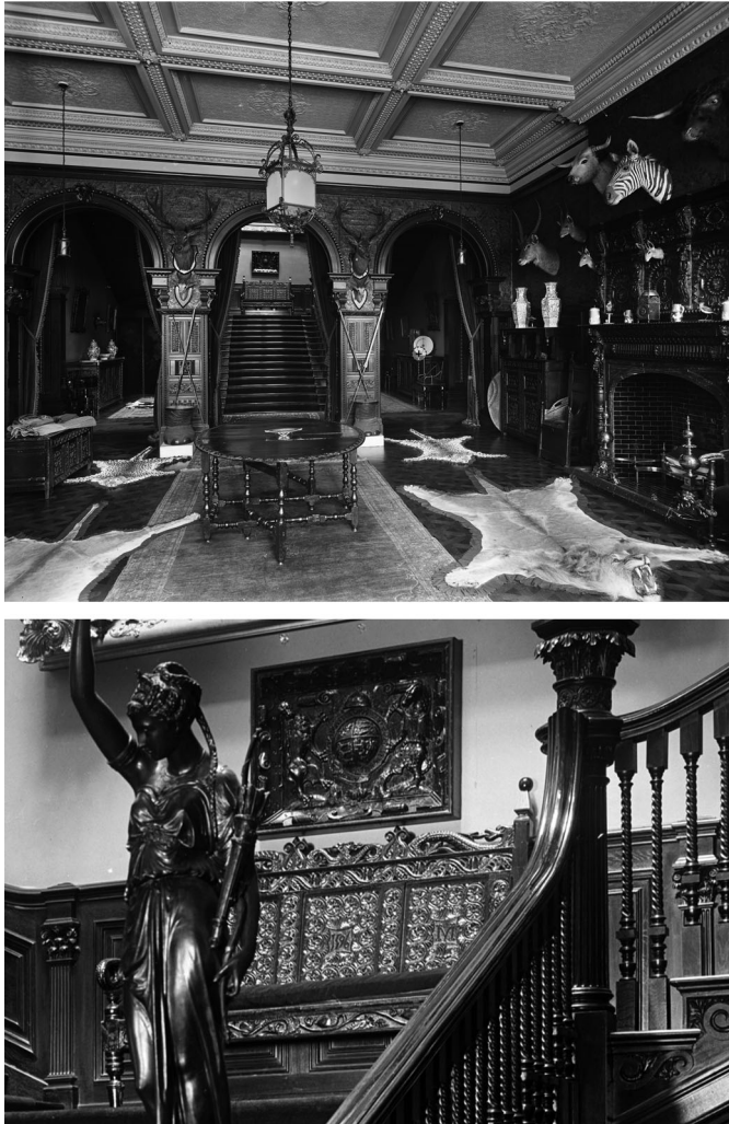
FIG. 13. Views of the interior of Rolleston Hall, Staffordshire, showing the N.M. 1596 settle on the house's principal staircase landing, 1892

for if it was the gift from Elizabeth I to Sir Nicholas. The inventory descriptions for the now ex-royal collection bed are the same and read: 'oone bedstede gilt and painted with iiij of the planettes in the hed/and sondry other stories in the sides and fete being in length ij yerdes quarter and in bredith oone yerde iij quarters di/having Ceeler Tester'. 61 This certainly appears to fulfil the description of the bed made by Sir Oswald as a 'handsomely-carved oak bedstead', and, as noted, it matches the unaltered size of what is now known as the Henry VII and Elizabeth of York marriage bed (Fig. 11). The bed