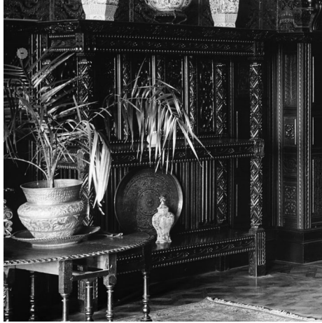
FIG. 16. View of the entrance hall of Rolleston Hall, Staffordshire, showing the hall cupboard, 1892