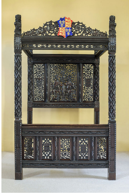
FIG. 11. The 'Henry VII and Elizabeth of York Marriage Bed'