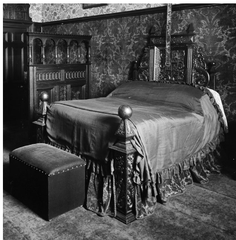
FIG. 18. View of the interior of Rolleston Hall, Staffordshire, showing the Oak Bedroom, 1892