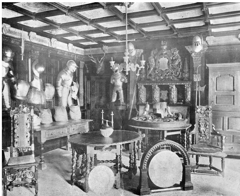
FIG. 5. View of the Hall at St Chad's, Uppermill, as seen in 1920.

Hall, which has the crest or bulls [ sic ] head with a coronet round its neck, stained upon it' as a record of his family's armigerous qualifications and identity. 35 Despite the glass's poor state of preservation, it remained an important family relic: