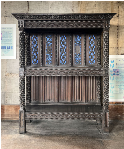
FIG. 17. George Shaw, duke of Northumberland's hall cupboard, 1847