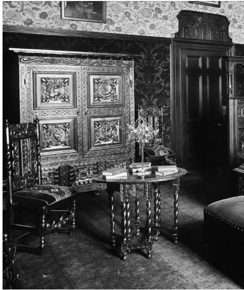
FIG. 22. View of the interior of Rolleston Hall, Staffordshire, showing the Oak Bedroom, 1892

(Fig. 19), but with the headboard featuring a suitably specific heraldic panel depicting the Mosley arms surrounded by gadrooning. Each headboard's central panel is set amongst fluted pilasters, flanked by panels with S-scrolled cockatrices and finished throughout with pyramidal finials: these are also replicated at Shaw's house, seen in Figure 5. Shaw supplied another version of this bed to the duke of Northumberland with suitable arms, and he described it on 14 March 1848 as an 'Elizabethan State bed with the Earls Arms badges Supporters — garter &c' and he valued it at £55. 78 Another example of this bed by Shaw is preserved at Gawthorpe Hall in Lancashire (Fig. 20), where the arms carved into the headboard panel approximate Shuttleworth impaling Fleetwood, and the footboard is decorated with two barbed hour-glass escutcheons charged with R and S for Richard Shuttleworth (presumably c. 1613–48). These four beds form a coherent group within Shaw's repertoire, and they relate to an example included in Henry Shaw's Specimens of Ancient Furniture (1836), that, in the annotation to the plate, is recorded in the collection of Samuel Rush Meyrick (1783–1848) — a personal contact of Shaw's — at Goodrich Court in Herefordshire (Fig. 21): 79