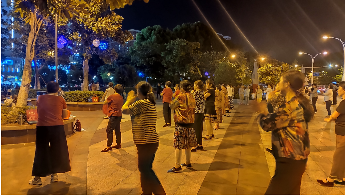
Figure 1: Dancers at Hanlin Plaza in Suzhou Industrial Park. September 2022.