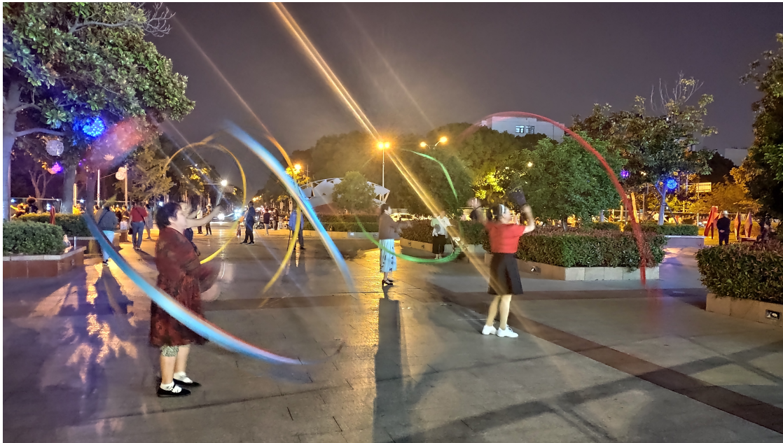
Figure 3: Groups of dancers with ribbons at Hanlin square in Suzhou Industrial Park. Photo by Claudia Westermann, September 2022.

group of dancers closest to the street appears to be the most organized. At times the dancers use props. This group has folding fans; another has ribbons (Figure 3). Later in the evening, the group next to the market dissolves its lines and engages for the next hour in a form of ballroom dancing. Line dancing is pái wǔ (排舞). Ballroom dancing is jiāoyì wǔ (交谊舞). Between the groups, a man practices Tai Chi. Some children run after a ball. At the plaza's North entrance, a man has placed a mobile karaoke station. Some passer's by stop and sing.