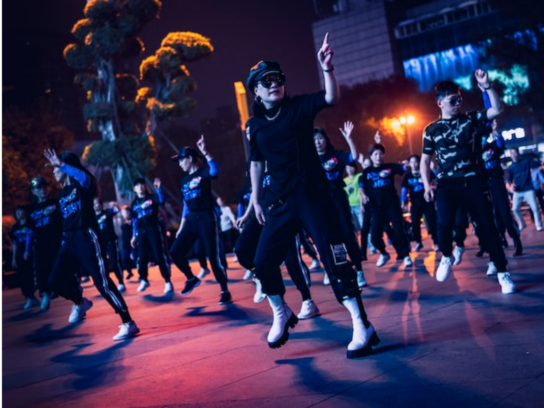
Figure 4: Young urbanites dancing on a public square. Photo by Li Lin (northwoodn) via Unsplash, 10 November 2020. Public domain.

There are three main factors that led to the rise of public square dancing in China. After 1978, with the opening-up, the government withdrew financial support from the cultural centres of the dānwèi that had previously provided free leisure activities. While the options for leisure diversified immensely, commercial leisure was too expensive for the unemployed or workers in poorly paid jobs (Lu 2006). Yet, Chinese cities suddenly had an unprecedented number of residents who did not have much money to spend on leisure as tens of millions of workers were laid off when the state-owned enterprises were reorganized, and millions of people migrated from rural locations into the cities (Friedmann 2005; Fan 2011). Dancing in public squares, thus, in the 1980s, emerged as the cheapest and most convenient way for workers to ‘satisfy their social and fitness needs’ (Seetoo and Zou 2016). Monthly contributions are paid often but tend to serve just the maintenance of the audio equipment and are usually less than 40 CNY (~5 GBP) per person per month (Qian 2014; Qian 2017).