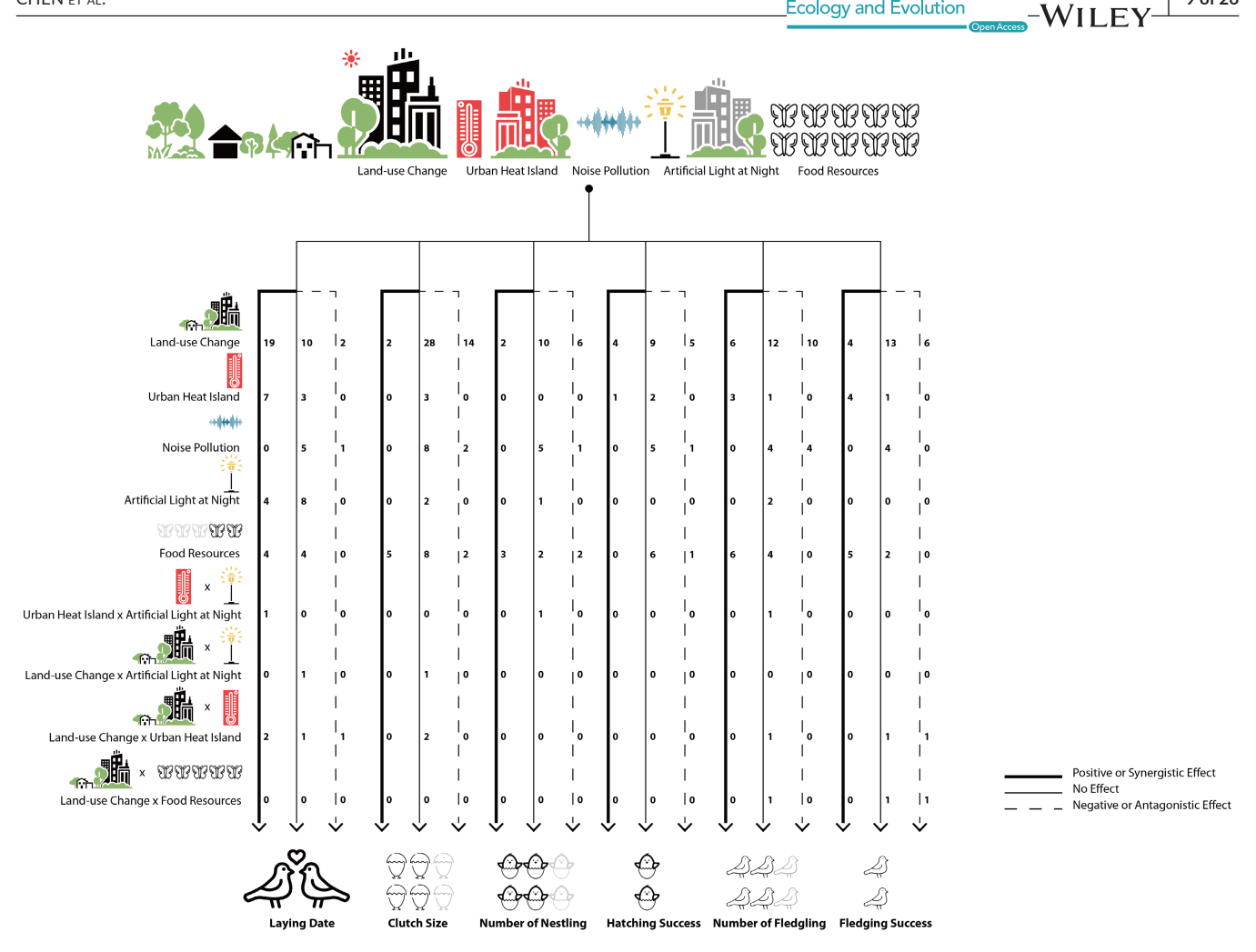
FIGURE 3 Diagram illustrating patterns and summaries from the results of systematic review about the effects of land-use change, urban heat island (UHI), noise pollution, artificial light at night (ALAN), food resources, and any interactions between these factors, on lifehistory traits and breeding fitness. For laying date, a "Positive Effect" indicates advanced laying dates, but does not imply that advanced laying dates produce positive effects on breeding fitness for the species. For the remaining life-history traits, "Positive Effect" denotes better reproductive performance (larger clutch size, higher number of nestlings or fledglings, higher hatching, or fledgling success) in urban areas, or at higher temperature, noise, light illumination, or with more abundant food conditions. Numbers besides the arrows represent the number of times that studies report such an effect. As for combined effects of these environmental factors available from the systematic review, we compared the interactive effects between environmental factors to the individual effects reported in the studies-for example, comparing the interaction of UHI and ALAN to individual effects of UHI and ALAN-and then identified whether the interactive effect produced poorer or better effects on life-history traits and breeding fitness. If the combined effect did more harm compared to individual effects, a synergistic effect was then documented. Likewise, if the combined effect offset the negative effects of the individual factors, the antagonistic effect was then documented. We did not find any positive effects produced by combined effects and thus do not visualize this possibility; however, we cannot rule out the possibility that environmental factors may produce positive effects and in combination the positive effects get enhanced in some cases. For laying date, if multiple factors led birds to advance their laying dates more, then it is denoted as synergistic effect. For the remaining life-history traits, if birds had smaller clutch sizes, lower number of nestlings or fledglings, or lower hatching or fledging success due to the interaction of multiple factors, this is denoted as synergistic effect.

Insectivorous and omnivorous species like Mountain Chickadees Poecile gambeli (Hajdasz et al., 2019; Marini et al., 2017) and Great and Blue Tits (Gladalski et al., 2015; Seress et al., 2018; Wawrzyniak et al., 2015) experience 2–14 days of advancement in laying dates when breeding in urban areas compared to nonurban areas, which is associated with mild temperatures and available anthropogenic food resources. Additionally, Mazumdar and Kumar (2014) suggested that smaller clutch sizes in urban areas may be the cost of dealing with the shortened length of food peaks in urban areas.