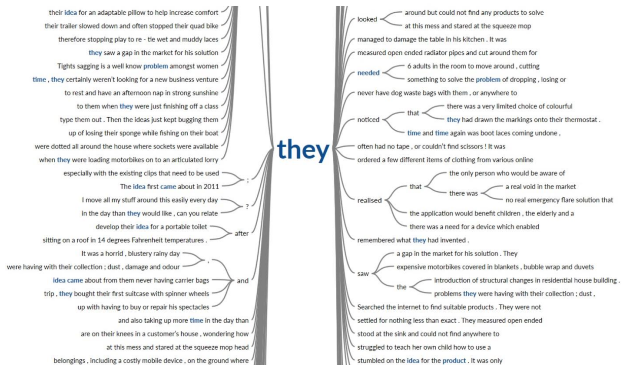
Figure 3. Detailed scenarios of situations leading to the discovery of a problem

useful in discovering an EDP. This uniqueness could be explored for crowdsourcing EDP in the 4IR. Although not all the cases presented could be considered an EDP, many are EDP. The same discovery concept generally applies to the discovery of EDPs.