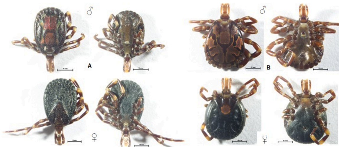
Fig. 2. Morphological comparison of male (indicated by ♂) and female (indicated by ♀) Amblyomma variegatum (A) and Amblyomma eburneum (B) collected from African buffalo.

with no significant difference between the sexes ( X^2(1, N = 160) = 1.344, p = 0.246 ). Sample MSMun993 exhibited a co-infection with both E. ruminantium and R. africae . Among A. variegatum samples, 35 of the 160 ticks tested positive (21.9%), which included 27 males (25.2%) and eight females (15.1%) with no significant differences between the sexes ( X^2(1, N = 160) = 0.213, p = 0.144 ) and no co-infections were detected. There was no significant difference between A. eburneum and A. variegatum prevalence for R. africae ( X^2(1, N = 320) = 6.929, p = 0.074 ).