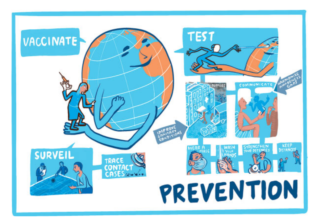
Fig. 1 Illustration of the PDA strategy: prevention of SARS-CoV-2 infection accelerated massive vaccination world-wide, epidemiological surveillance, masks, distancing, improvement of sanitary conditions, and setup of primary health care structures, which are capital elements for the mitigation and the control of the pandemic. PDA, prevention, detection, and anticipation.

understanding the epidemiology of the pandemic and its management. Pharmaceutical companies and consortiums having a pivotal role in the development of vaccines, diagnostic tests, and treatments for COVID-19 need to cooperate and diffuse technological knowhow for massive production of the tools required for the control of the pandemic. According to the WHO and the World Trade Organization, there is an urgent need for "global solidarity and unhindered global sharing of technology and knowhow."103,104 The recent recommendations of the Council for Trade-Related Aspects of Intellectual Property Rights of the World Trade Organization should be taken into consideration,<sup>105</sup> without blind limitations of the Trade Related Aspects of the Intellectual Property Rights Agreement especially in the light of a devastating pandemic. Unconditioned technology transfers should be eased so that the production and supply of COVID-19 medical goods, including vaccines and tests, will be boosted and more global access to them will be available. In the same line, the elaboration of an enlarged industrial action plan coordinated by the WHO is required for the development and production of the second-generation vaccines, free of patent restrictions.