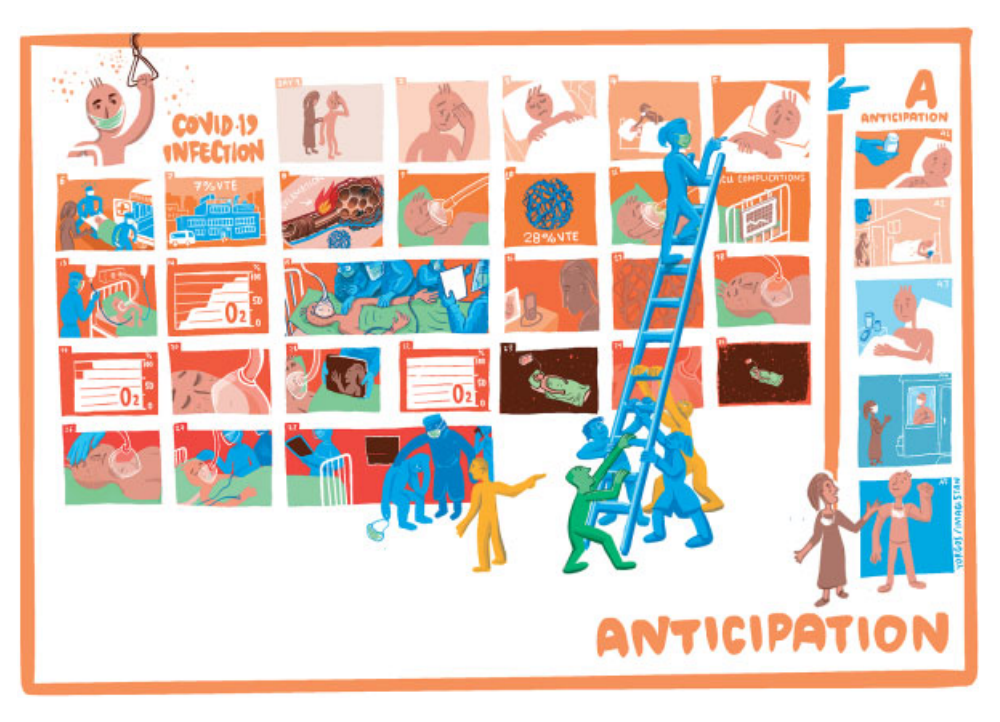
Fig. 3 Illustration of the PDA strategy: anticipation—medical treatment in patients with COVID-19 is essential for improved clinical outcome. Early identification of patients at risk of disease worsening and application of the recommended treatments at the level of the primary health care structures are related with improved clinical outcome and decreased mortality. The first 5 to 7 days after SARS-CoV-2 infection is a critical period for that requires identification of patients at risk of disease worsening and personalized therapeutic strategy . PDA, prevention, detection, and anticipation; VTE, venous thromboembolism.

recommendations of the relevant consensus statements and scientific societies. It is important to renew all of these prescriptions for avoiding any rupture and omission in these vulnerable patients.