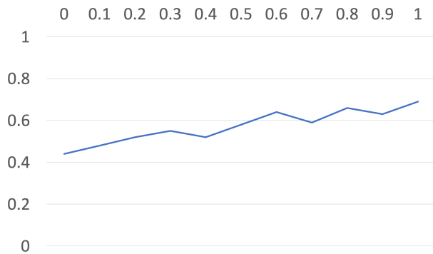
Figure 2: Evaluation of debias controlled models using FN evaluation method. The vertical axis shows the bias score, and the horizontal axis shows r .