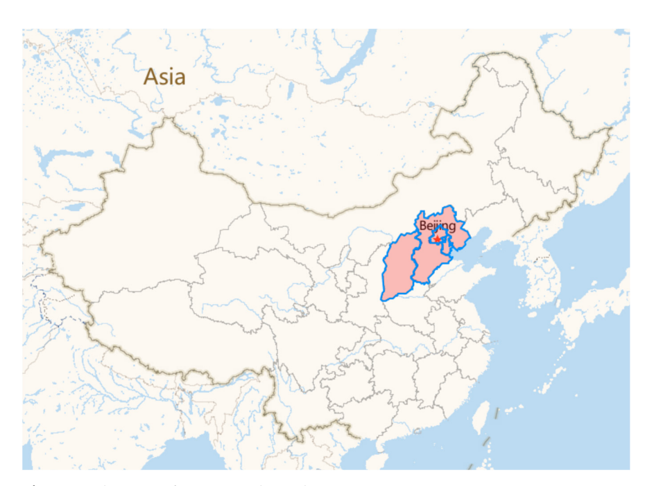
Figure 2. The map of Beijing and its adjacent regions.

A total of 356 valid questionnaires were collected. Table 1 summarizes respondents' demographic and socioeconomic characteristics. Approximately 59% of respondents were female. Among respondents, 55.6% were 60–69 years old, and 44% were older than 70. In this study, the percentage of respondents with educational levels of a certificate of secondary school and below, high school, and college and above were 47.5%, 25.5%, and 26.9%, respectively. Most respondents (82.3%) lived with their partners. The number of respondents with a monthly income of RMB 2000–3000 (USD 300–450) was slightly higher than that of other groups. Over half of the respondents (59.5%) had a monthly income of RMB 2000–5000 (USD 300–750).