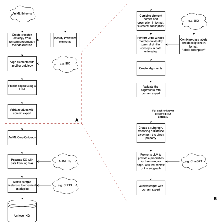
Figure 1: The AnIML2KG pipeline: the overall pipeline is shown on the left; Section A is expanded on the right (Section B) to illustrate the use of ontology alignment in the knowledge capture stage.

ontologies, as the same concepts may be described in different ontologies in different ways [10]. This can be particularly problematic when aligning ontologies, as alignment algorithms may struggle to identify that two concepts are related when they represented in different ways, leading to a low precision and recall [11].