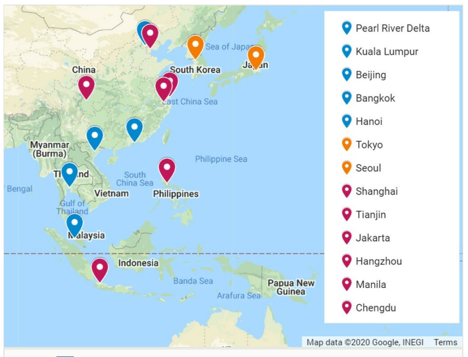
Figure 1. doi

Megacities in East-Southeast Asia featured in Figure 1 of Schneider et al. (2015). Butterfly sampling has been completed in urban parks by the "Urban Butterflies in Asia Research Network" (Sing et al. 2017, Sing et al. 2016a, Sing et al. 2016b, Sing et al. 2019, Wilson and Sing 2020) at those megacities with blue markers. Butterfly sampling has been completed in urban parks by other researchers (Matsumoto 2015, Nagase et al. 2019, Lee et al. 2015) at those megacities with orange markers. To our knowledge, no butterfly sampling has been published for urban parks at those megacities with magenta markers.