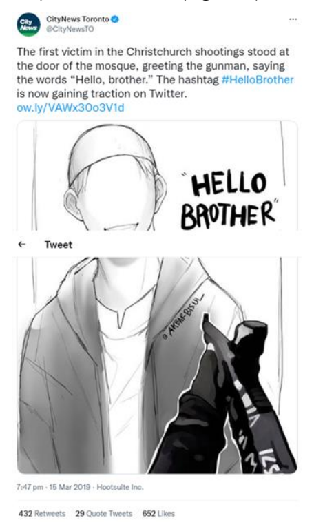
Figure 4. An illustration widely circulated with the #hellobrother (courtesy of Akbar Bisul)

before an image of the victim was released). The network diagram shows the activity around the top retweeted tweets and how they are connected (Figure 5).