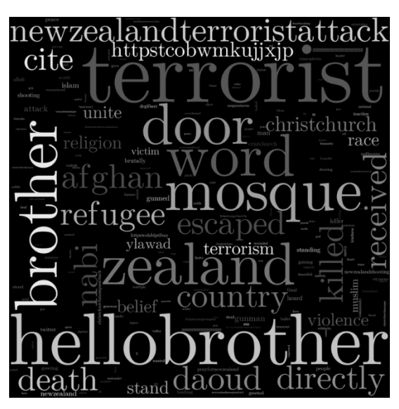
Figure 3. Keywords

Figure 3 shows the keywords from the hashtag which clearly point to the circulation of the tweet shown in Figure 2.