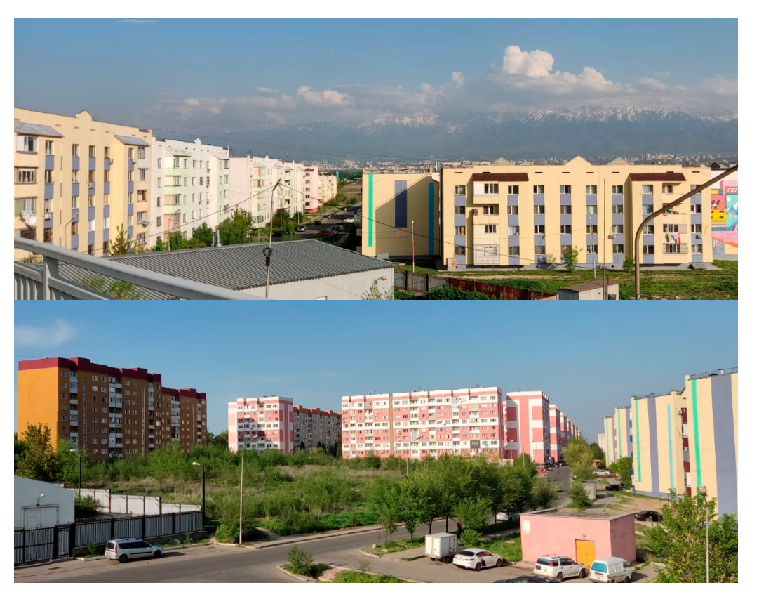
Figure 2. Views of the surveyed social housing complex, Almaty, Kazakhstan.

Participants aged 18 years or older were considered eligible to participate in this study. To ensure the survey reached a representative cross-section of the Zerdely population, a total of fifteen trained interviewers from the Department of Pharmaceutical Technology of Asfendiyarov Kazakh National Medical University were used. These interviewers administered the face-to-face questionnaire survey in the respondents' approved language version, using Kazakh or Russian language formats, prior to obtaining the signature on the participant consent form to ensure inclusivity and comprehensiveness in data collection. An introductory script was used to introduce the survey to each resident. The survey interviewers went door-to-door in pairs and administered the survey using a paper questionnaire distributed throughout the neighbourhood to cover apartments with different plan layouts, exteriors and floor heights.