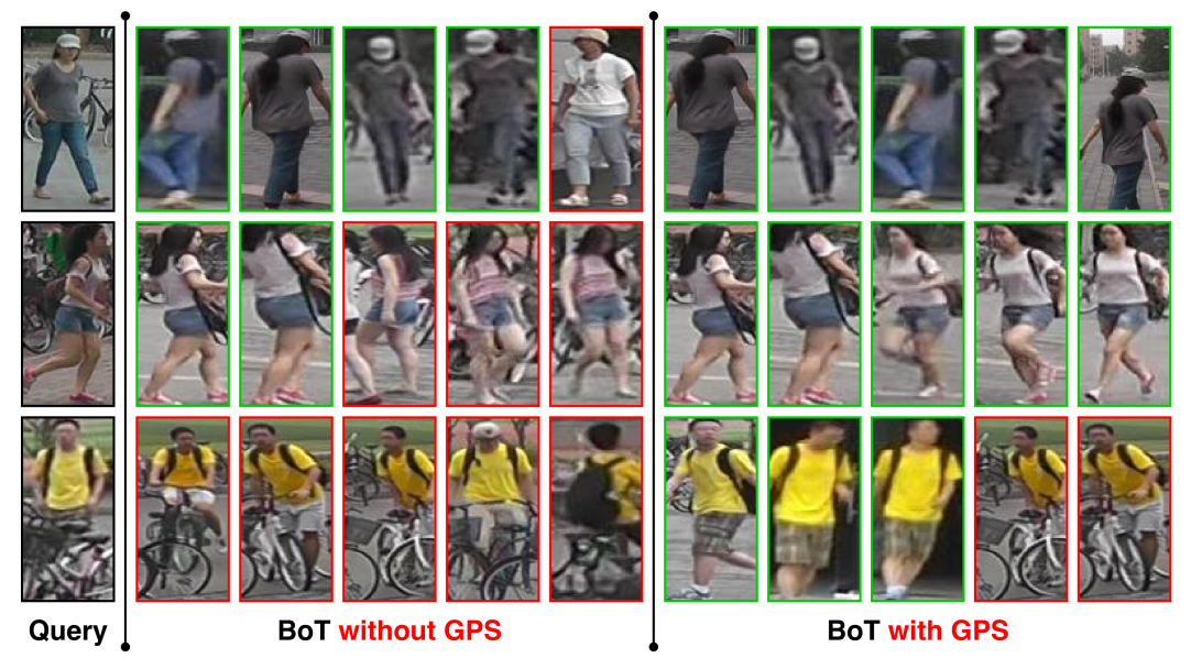
Figure 3. Top 5 retrieval results of some queries on Market-1501 dataset [56]. Note that the green/red boxes denote true/false retrieval results, respectively.

the-art mask-guided method P^2 -Net [10] by 4.9%, 1.7%, 2.1%, 1.7% at mAP, R-1, R-5, R-10, respectively. Besides, we also achieve comparative results with other ReID approaches.