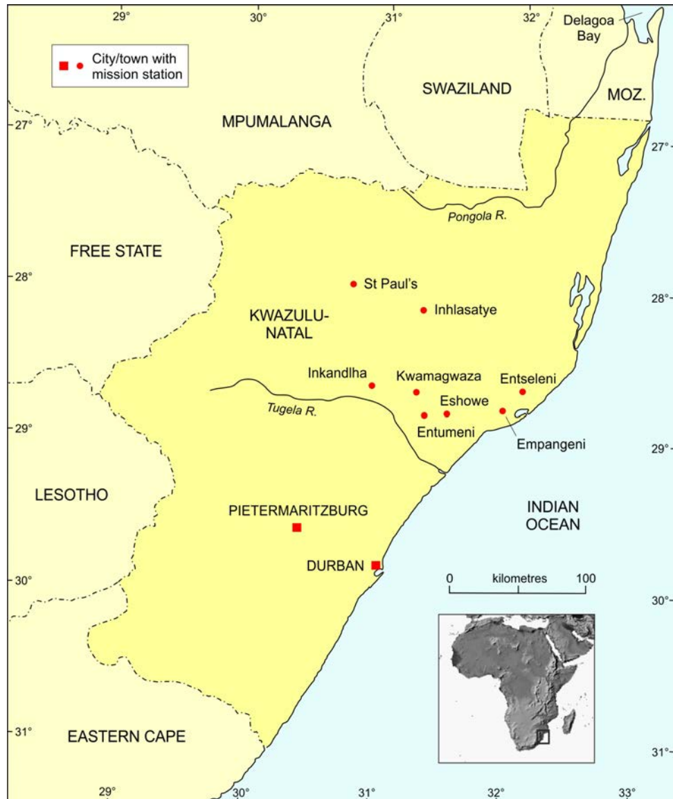
Figure 1: Map showing key locations referred to in the text against present-day boundaries of KwaZulu-Natal province, South Africa.

causal linkages. The richness and continuity of these materials, therefore, permits us to explore climate-society relationships in far greater detail than the late-eighteenth/early-nineteenth century timeframe of the majority of historical studies in the region (e.g. Ballard and Eldredge). 4