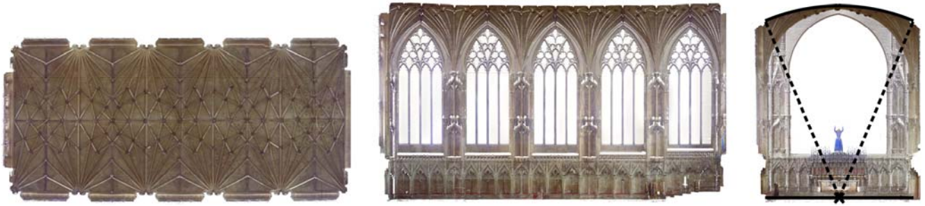
Fig. 2. Orthophotos created using the point cloud model of the Lady Chapel in plan (left), long section (centre) and short section (right).