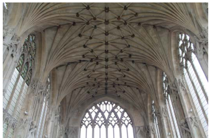
Fig. 1. Lierne vaults in the Lady Chapel at Ely cathedral.

Today, advanced digital surveying tools such as laser scanning and photogrammetry, are widely accessible, allowing us to record historical artefacts quickly and accurately, particularly when compared to analogue methods. Our project does not intend to demonstrate specific advances in digital surveying techniques, and instead shows how such tools are used to enhance understanding of medieval vault design. Here, we discuss one of our case study sites, the Lady Chapel at Ely cathedral in East Anglia (Fig. 1), the digital methodology we used, as well as our findings to date.