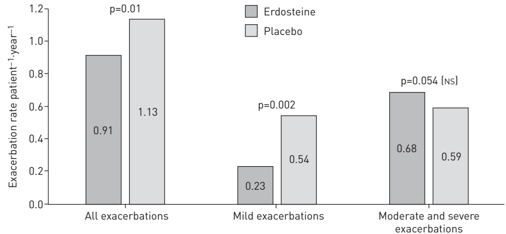
FIGURE 2 Mean exacerbation rate in the study period (1 year). ns: not significant.

groups ( 8.1 \pm 5.2 days with erdosteine versus 10.4 \pm 8.2 days with placebo; p=0.039 and 11.1 \pm 8.9 days with erdosteine versus 14.1 \pm 10.8 days with placebo; p=0.041 , respectively) (figure 3). No significant differences were registered for both the exacerbation rate and duration among those patients taking ICSs and those patients not taking ICSs.