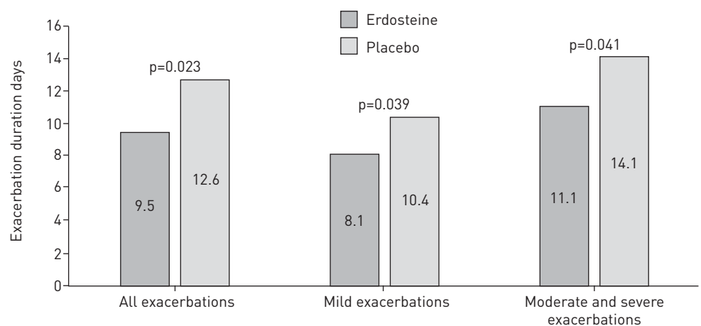
FIGURE 3 Mean exacerbation duration in the study period (1 year).

There were 706 adverse events reported during the study, 313 of them in the erdosteine group and 393 in the placebo group; only three (one serious) in the erdosteine group and five (one serious) in the placebo group were considered treatment related. There were 82 serious adverse events in 74 patients that occurred